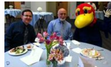
KUMC ON FACEBOOK