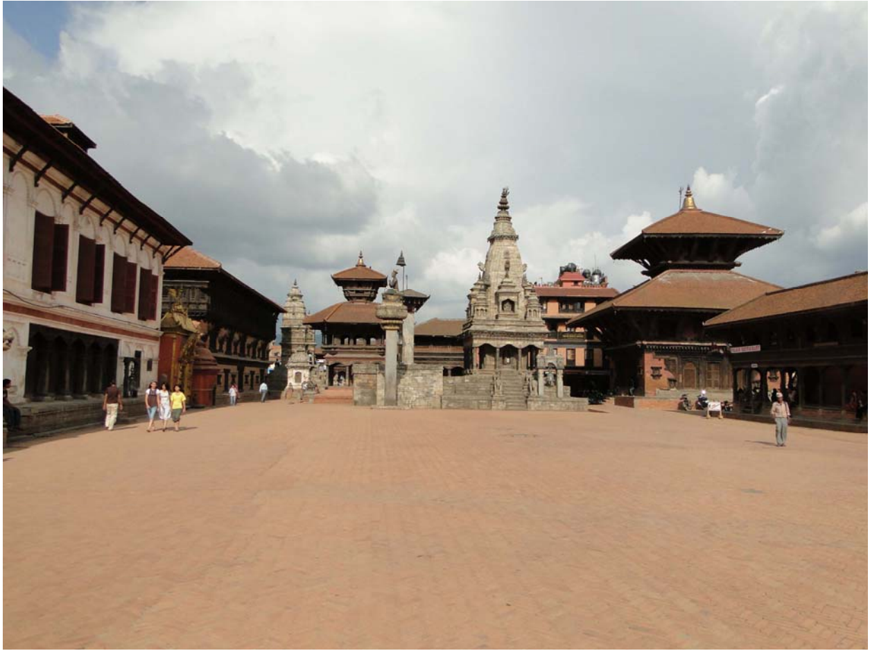
Figure 2. Bhaktapur Durbar Square (looking east): the palace is on the left (The photograph is by the author).