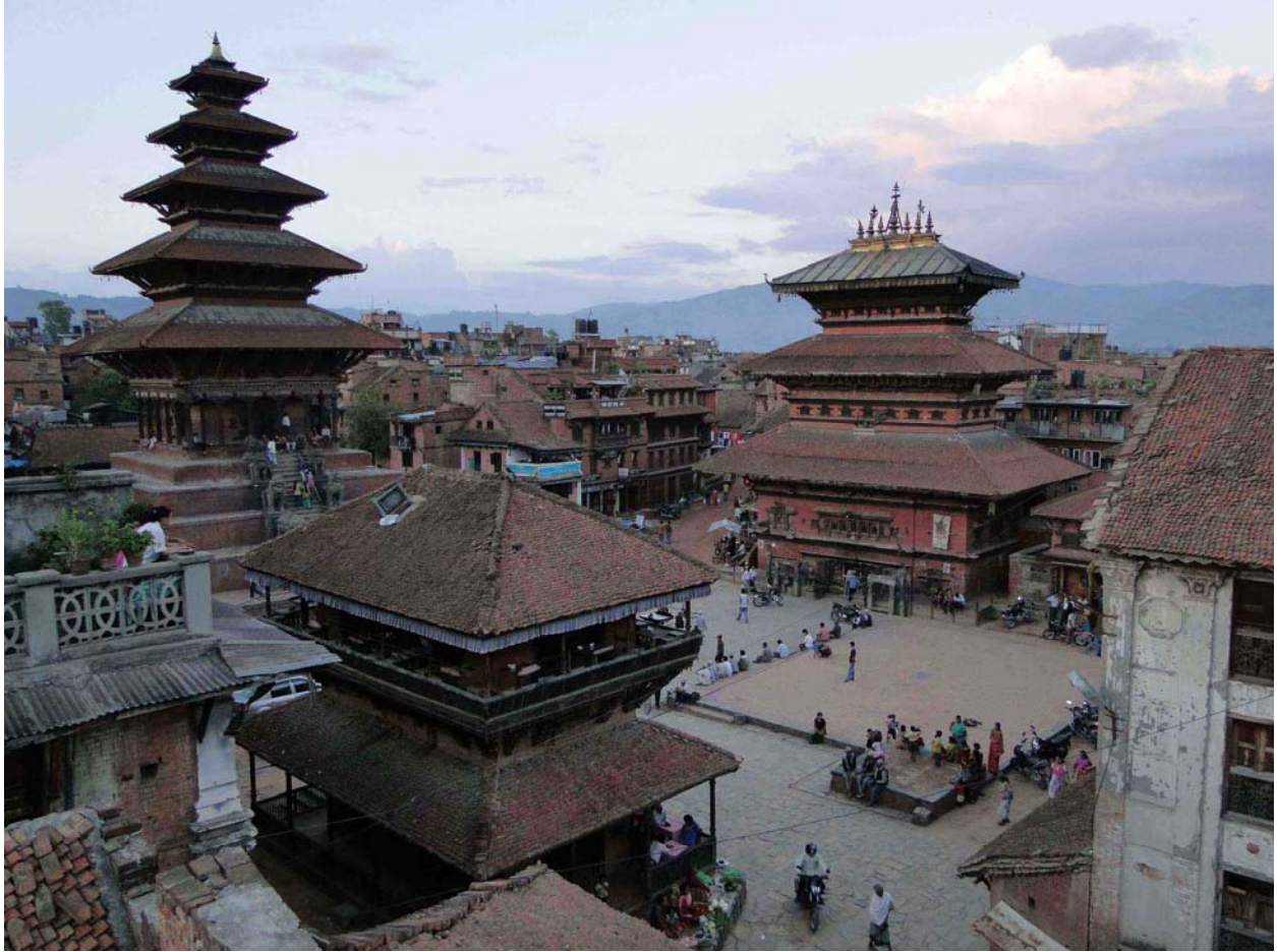
Figure 3. Taumadhi Square (looking north): the Nyatapola Temple (on the left), the Bhairav temple (right) and a Sattal (foreground) (The photograph is by the author).