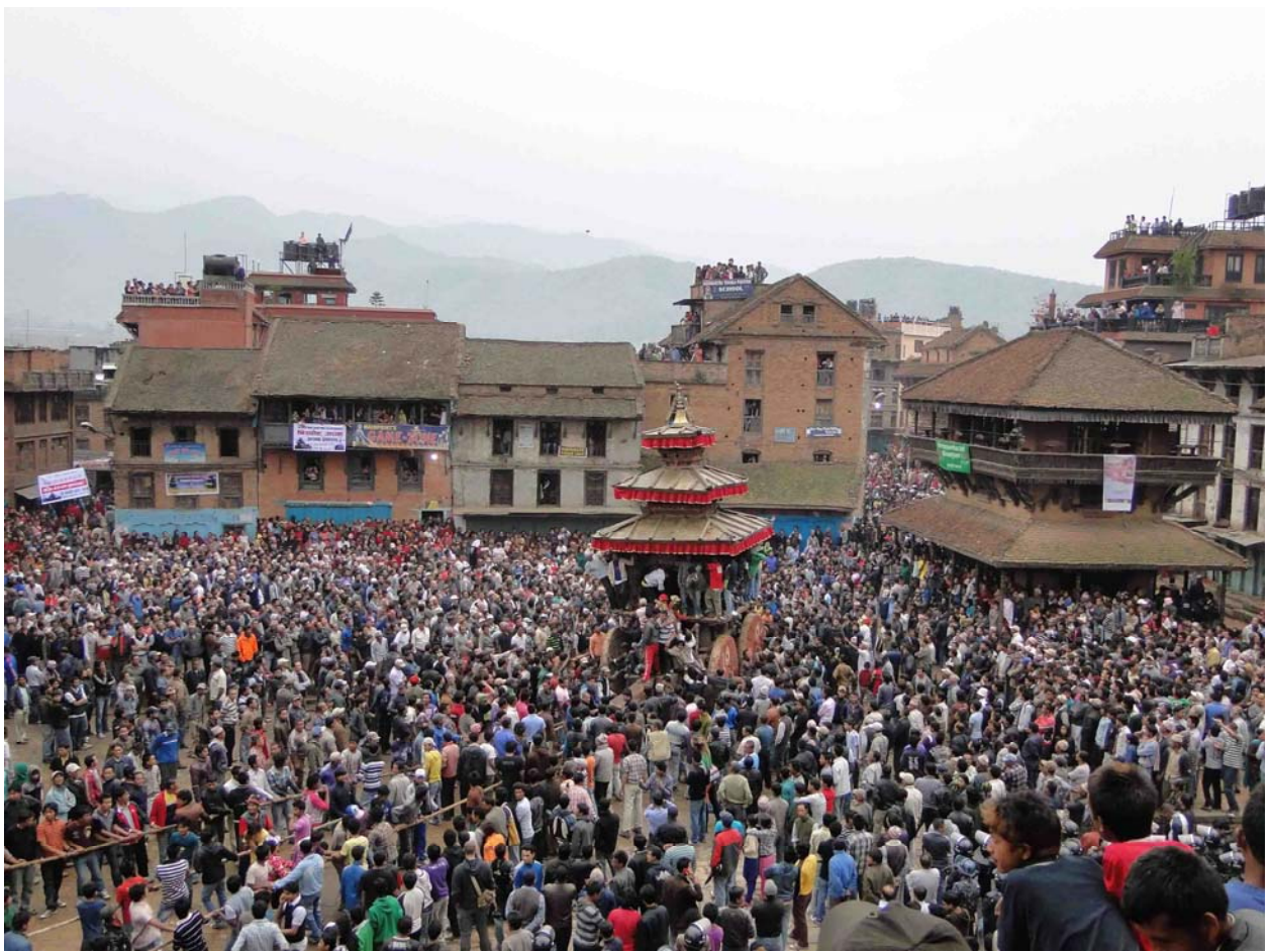
Figure 5. Bisket Jātrā in the Taumadhi Square (The photograph is by the author).