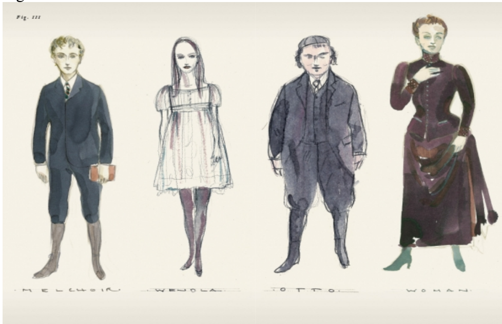
Costume renderings for Spring Awakening , the musical.