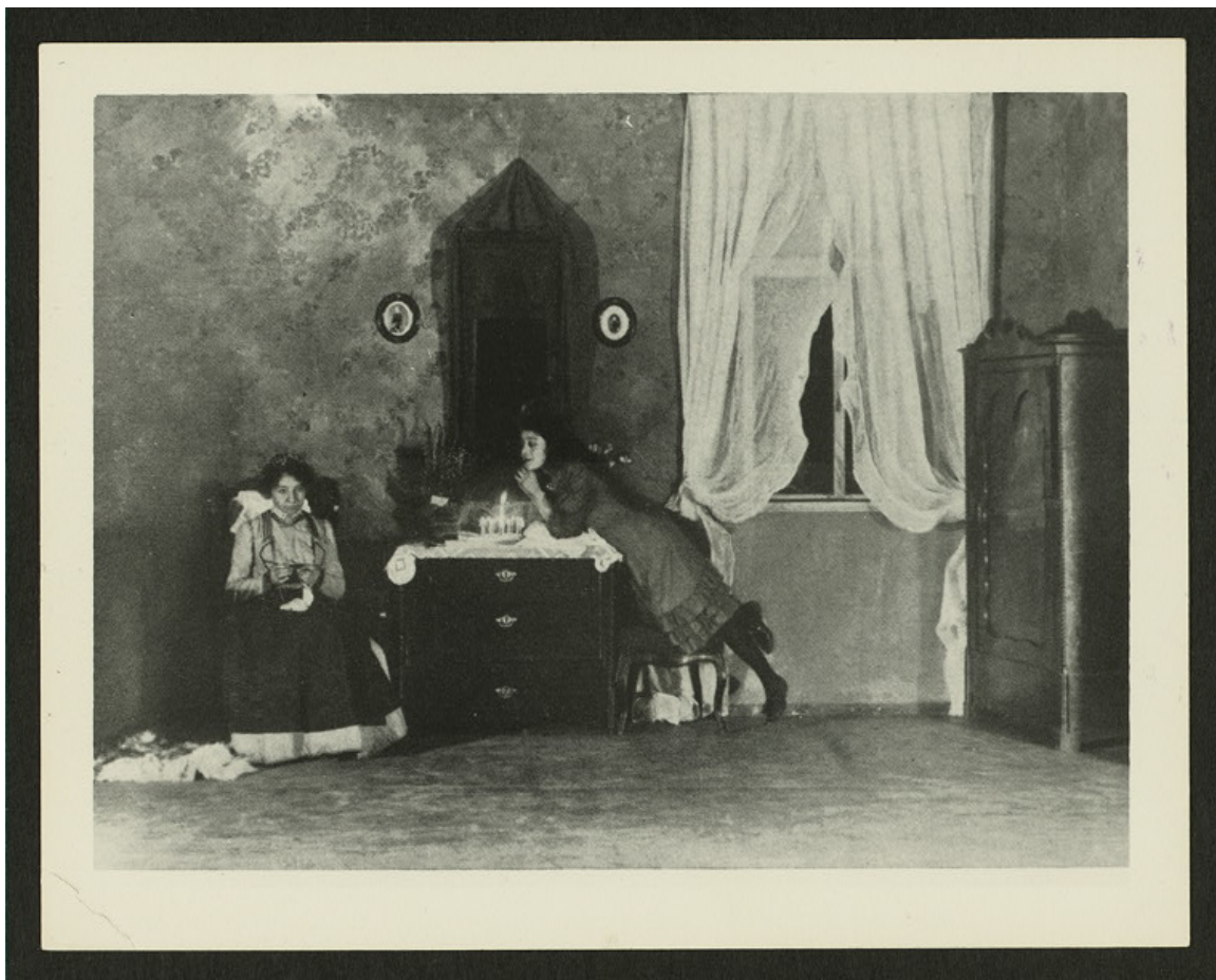
Picture of an early production of Spring Awakening , in which you see Wendla, wearing the short pinafore and speaking to her mother about how babies are made.