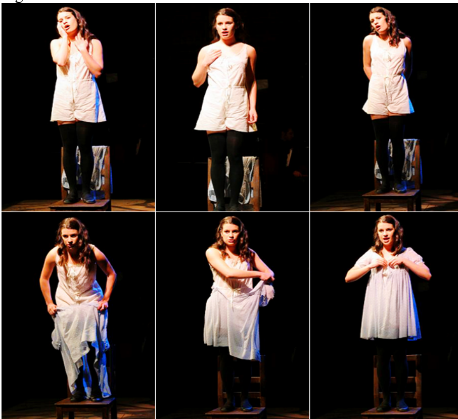
Lea Michele, original Wendla in the Broadway premiere of Spring Awakening .