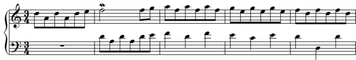
Example 9.5 Bach, “Dorian” Toccat a, BWV 538, mm. 1-3