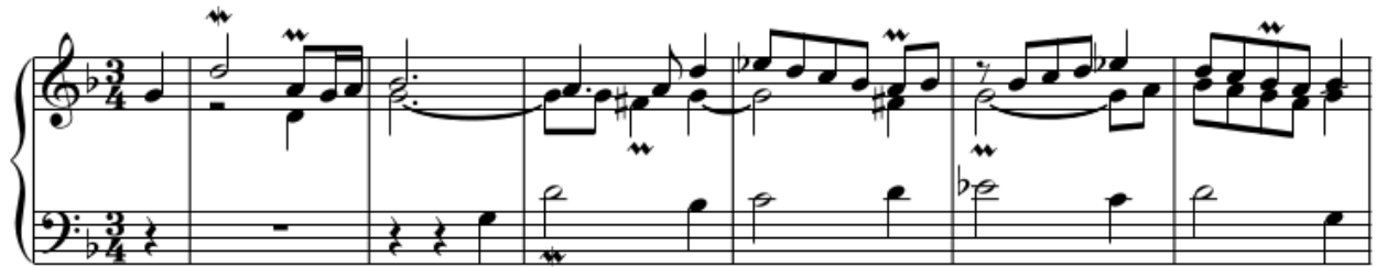
Example 9.2 Bach, Passacaglia , BWV 582, mm. 1-4