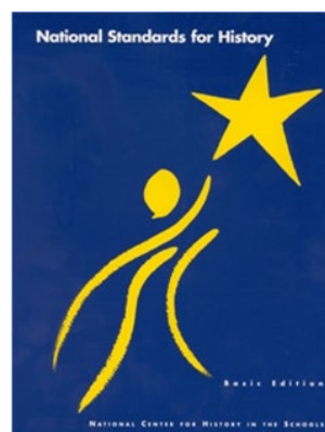
Figure 2. Cover of National Standards for History, Basic Edition , 1996. National Center for History in the Schools, University of California, Los Angeles.