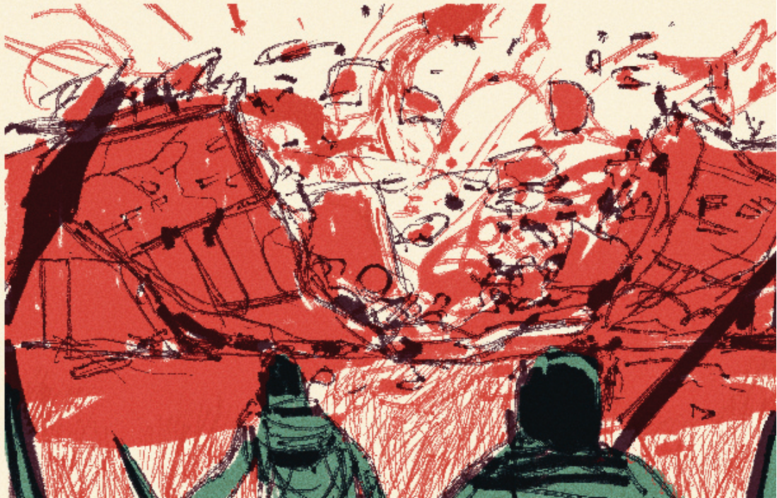
Jericho's walls are destroyed.