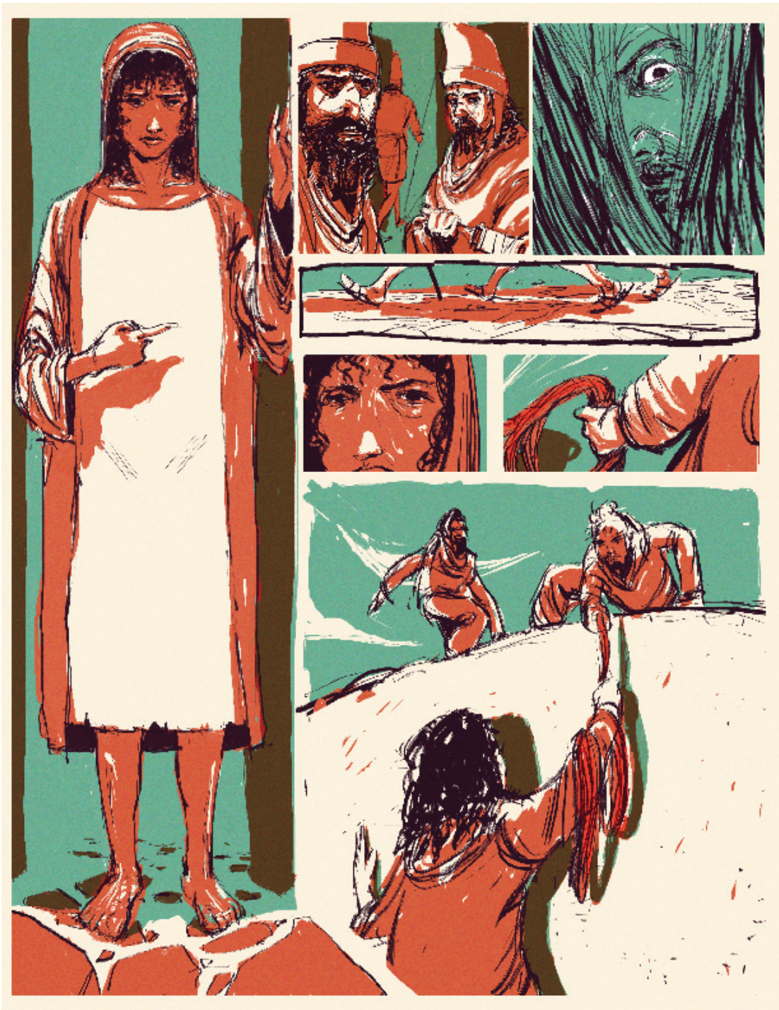
Rahab the Harlot and the Scarlet Cord