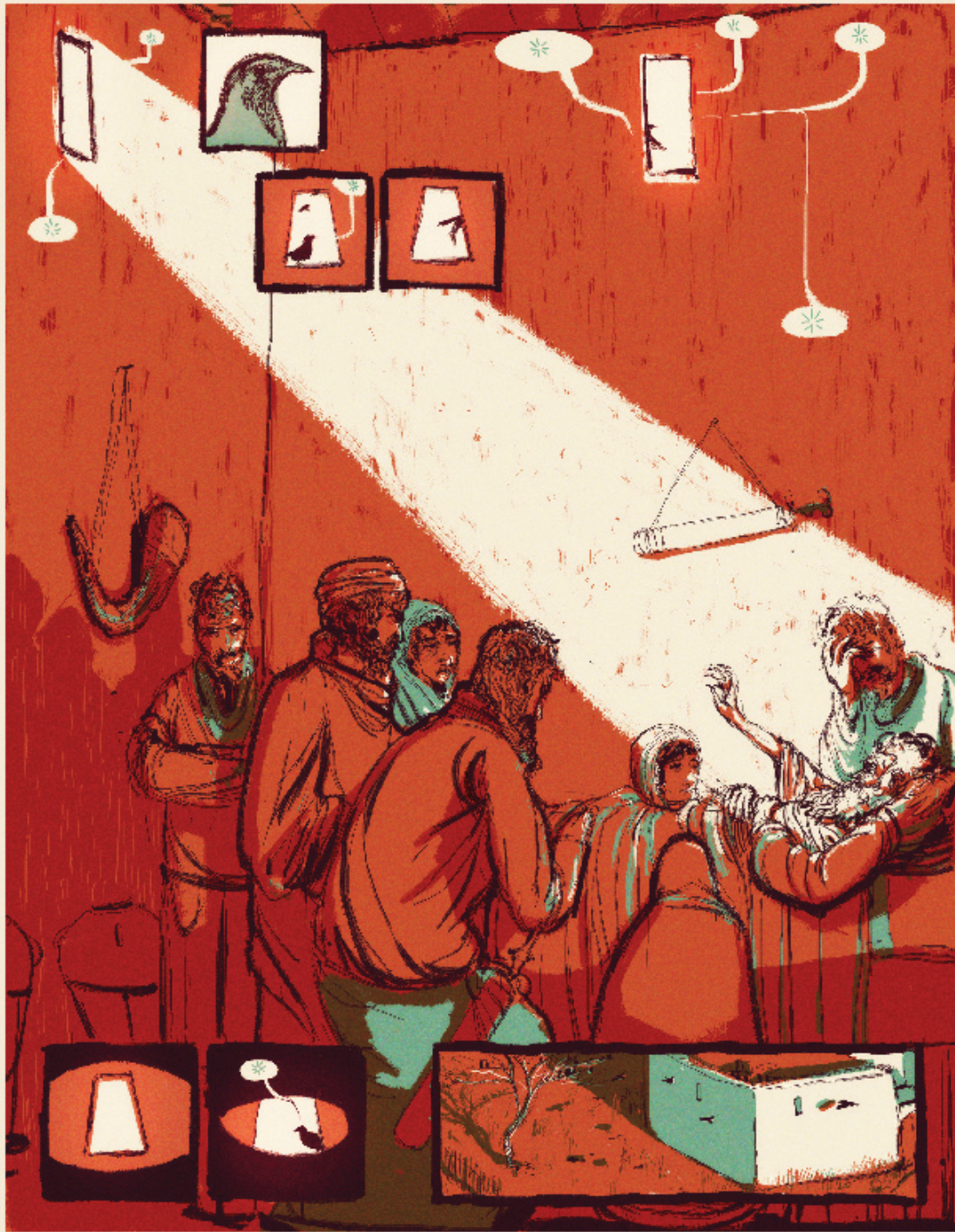
The Death of Joshua.