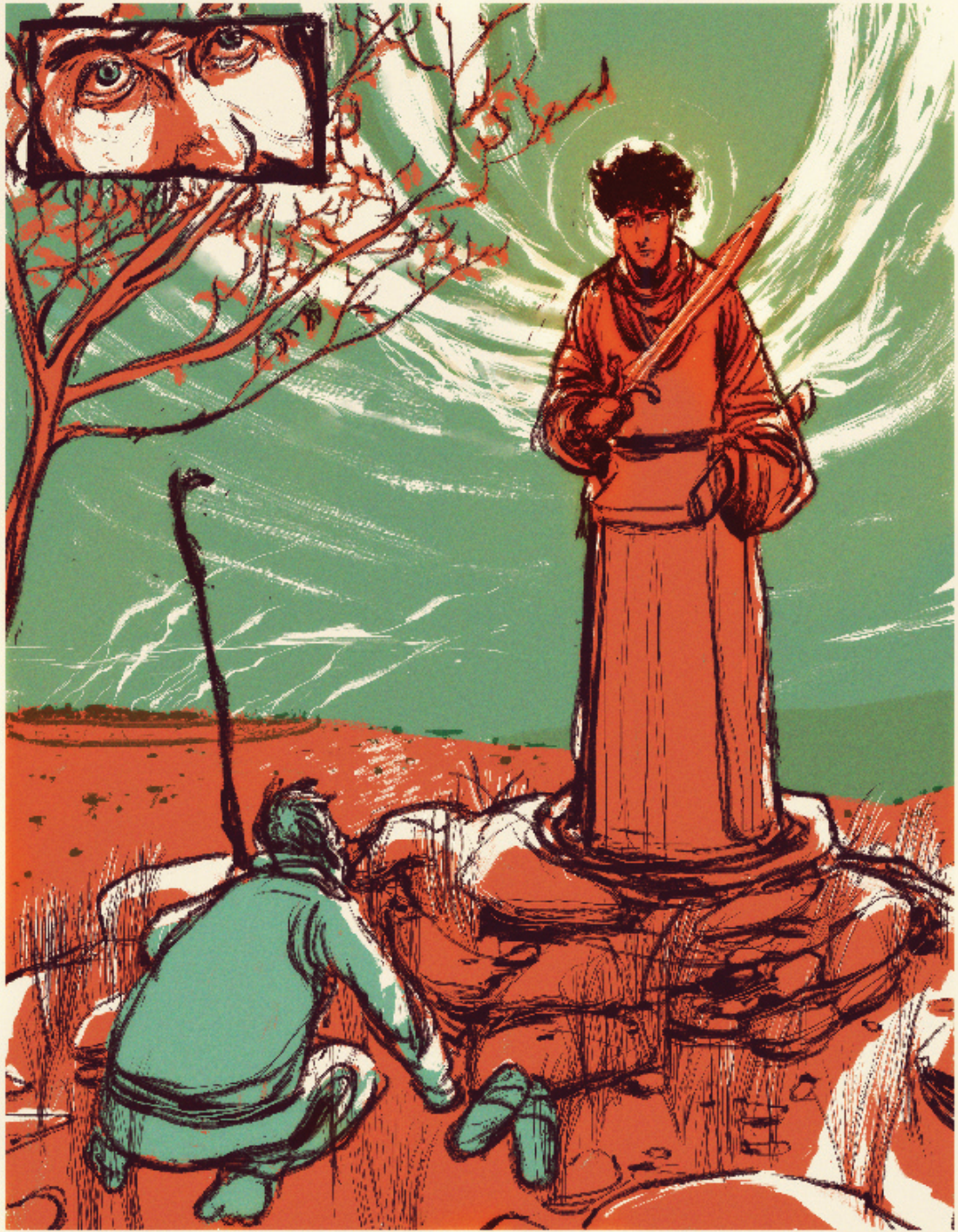
The Commander of God's Army appears to Joshua.