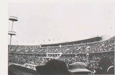
A normal crowd at the Olympics

Dr. Naismith likewise spoke with fairness about the widely publicized Eleanor Holm Jarrett case. He upheld the American officials who dropped the