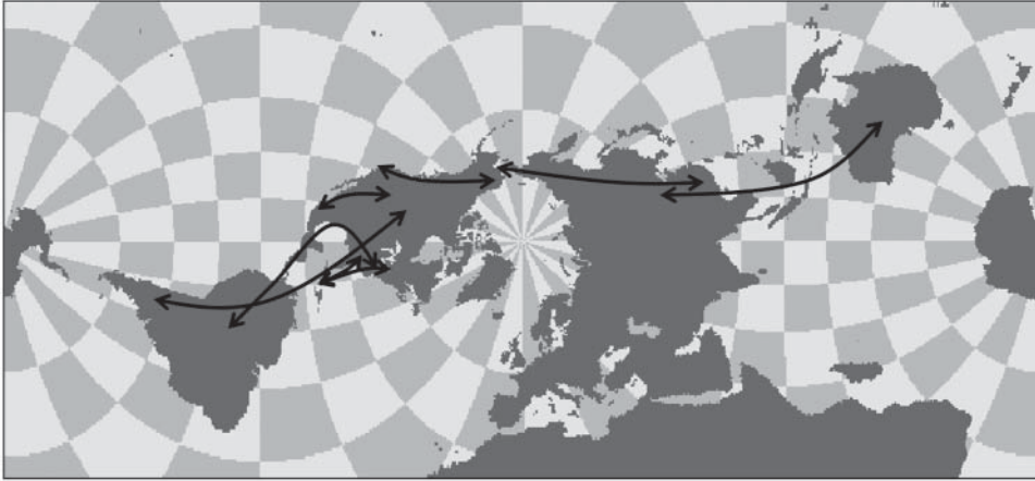
Figure 4. Schematic of key features of bird migration in the Americas, Asia and Australia, showing the potential role of western Alaska in transferring West Nile Virus from North America into eastern Asia.

relatively short time following its “jump” across the Atlantic Ocean. Its possible interactions with Asian and Australian strains of WNV (e.g. Kunjin virus) or other Asian flaviviruses such as Japanese encephalitis virus are unknown. Given that several shorebird species breed in Alaska and pass through or winter in the Hawaiian islands, the Pacific islands are another area of potential concern. Many Hawaiian island endemic bird species could be seriously threatened by the arrival of WNV.