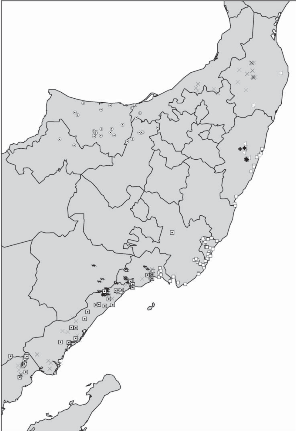
Figure 5. Example distributions — presently recognized species of Corvidae endemic to Mexico north of the Isthmus of Tehuantepec. Triangles, Cyanolyca mirabilis ; plus signs, Aphelocoma guerrerensis ; crosses in east, C. nana ; vertical squiggle, Cyanocorax dickeyi ; undotted squares, C. sanblasianus ; dotted squares, C. beecheii ; dotted circles, Corvus imparatus ; crosses in the west, C. sinaloae .