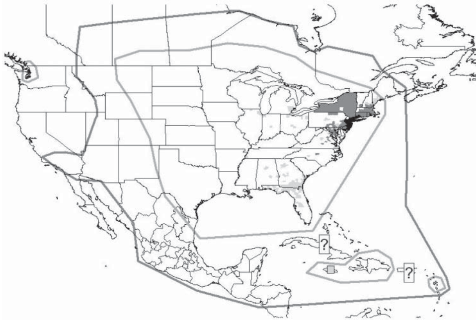
Figure 3. Summary of the pattern of expansion of WNV in the New World. Black, 1999; medium grey, 2000; light grey, 2001; inner (light) polygon, 2002; outer (darker) polygon, 2003.

surrounding New York City in 1999, the virus was essentially continental just 4 years later. As of early 2004, the only parts of North America from which WNV has not been documented are the extreme north, the Great Basin, and the Pacific coast from central California northwards to Alaska (except Puget Sound, Washington, where WNV activity occurred in 2002).