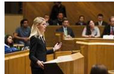
KU ON FLICKR

Moot Court competition 2012 More: photos | videos