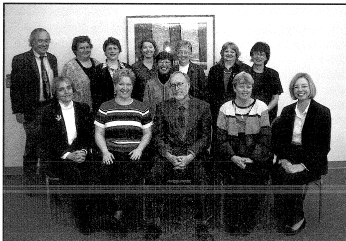
Regional Advisory Board members and MCR staff present at the 2002 RAB Meeting: