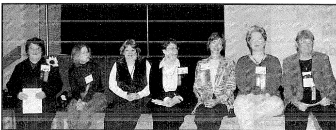
RML Liaisons wait their turn at the RML Update

The RML Update was an interactive experience this year as well. Of course, since it was scheduled for 7:30 Tuesday morning—after the terrific “Western Fun Night” Monday evening—the Update had to be lively to keep attendees awake. The room was divided into two teams, and the liaisons each highlighted one of their major projects from the last year through a trivia game. Although the format only allowed for the briefest introduction to the RML’s current work, it provided an overview of the wide variety of projects currently underway.