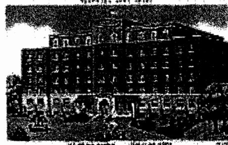
Historic Kentwood Hotel A Route 66 Postcard

2005 Annual Meeting page 1 2004 Annual Meeting Highlights pages 2-8 Honors & Appreciation pages 8-10 MFS Announcements pages 11-12 News & Announcements pages 13-14 In Memoriam page 15 MFS Member News pages 16-21 New Members page 22 Recent Releases: Websites & Recordings pages 22-23 Upcoming Events Calendar pages 24-30