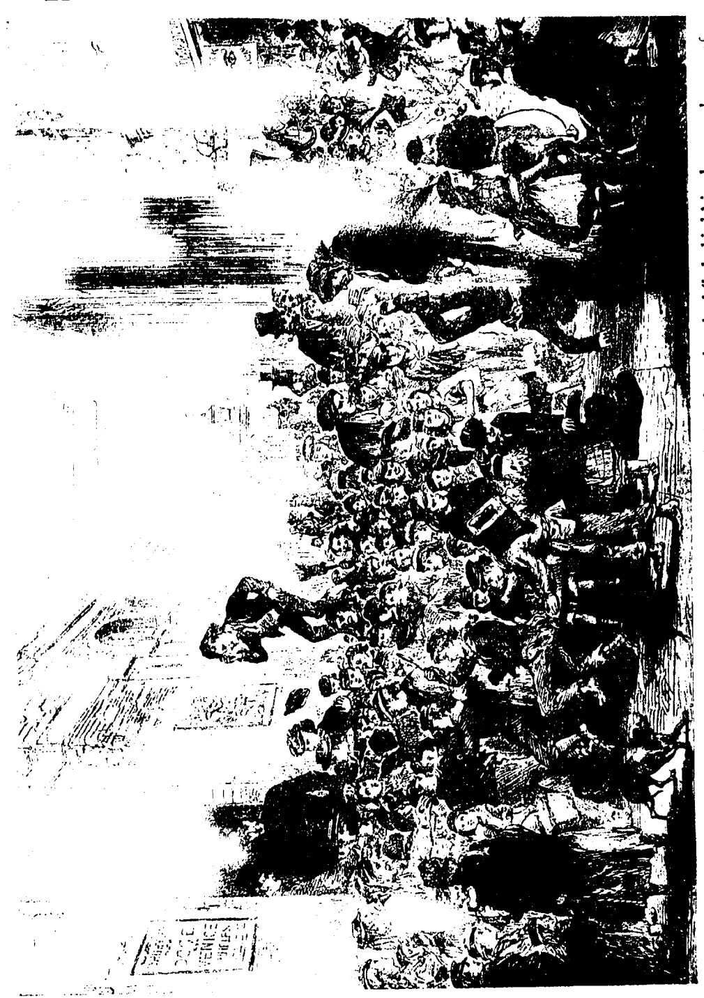
Engaging children for the pantomime at Drury Lane Theatre. The ballet of one hundred 'lady birds' in the second scene of Hush-a-bye Baby would have been drawn from similar sources.