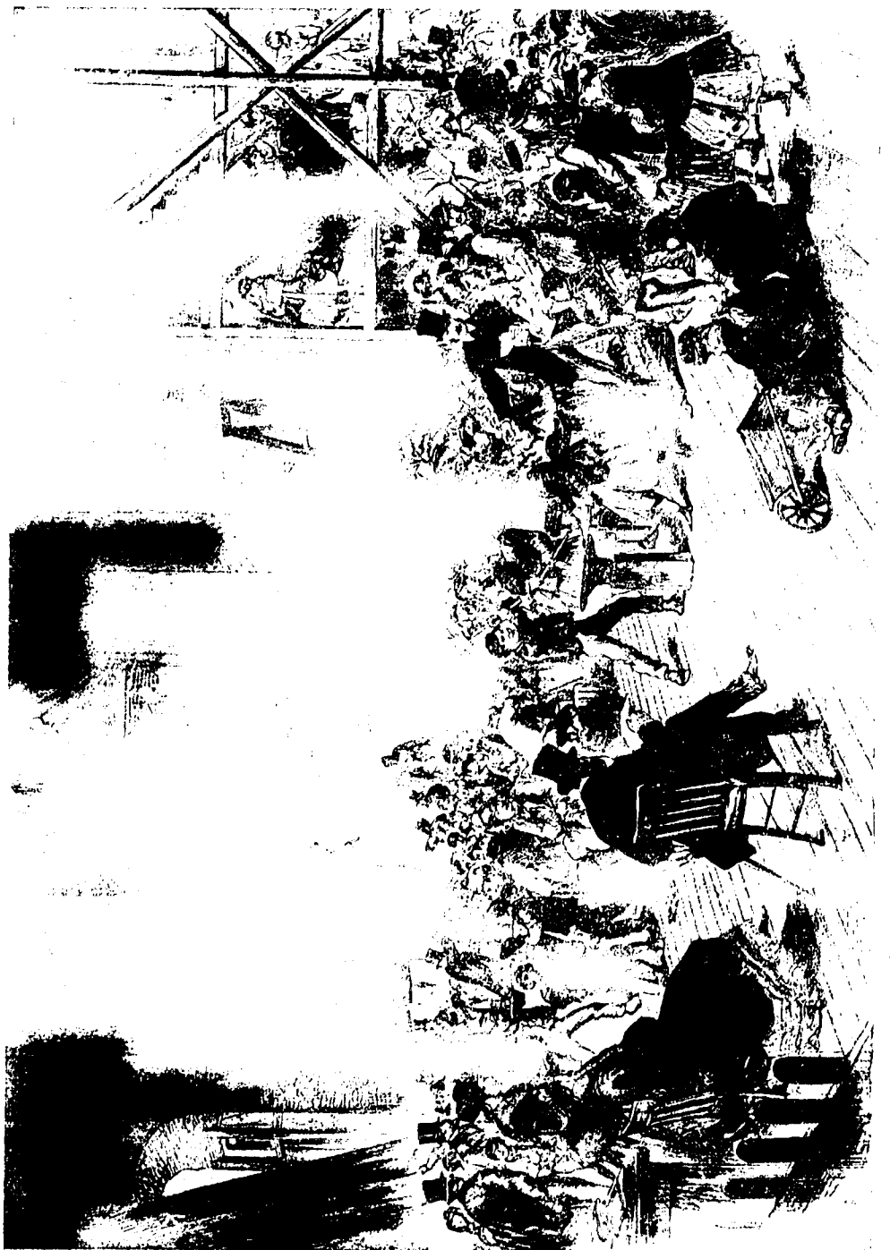
Children being rehearsed for a pantomime at the Lyccum Theatre (1868).