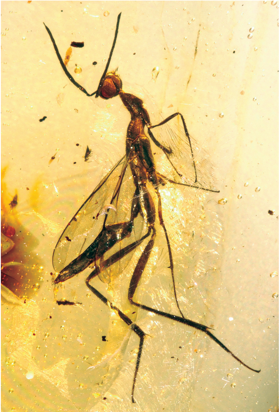
Figure 3. Leptofoenus pittfieldae Engel sp. n. (KU DR-019), photomicrograph of male holotype (length of specimen 8.8 mm).