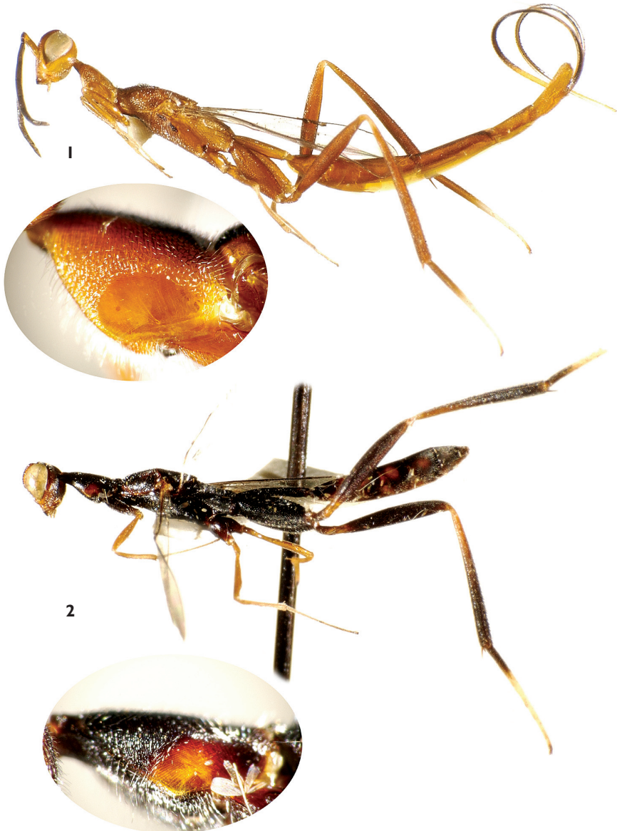
Figures 1-2. Photomicrographs of representative modern Leptofoenus species and lateral aspects of their pronota. 1 Leptofoenus rufus LaSalle and Stage, female. 2 Leptofoenus stephanoides (Roman), male. Specimens from the collection of the Division of Entomology, University of Kansas Natural History Museum.

toids of the Pelecinidae, Gasteruptionidae, and particularly the Stephanidae (Figs. 1-2), similarities reflected in the epithets for various species. When Leptofoenus peleciformis Smith was first described, Smith (1862) left open the familial assignment, reflecting this challenge in the name of the genus and species, the generic name implicating a placement near gasteruptionids and stephanids and the specific epithet indicating pelec-