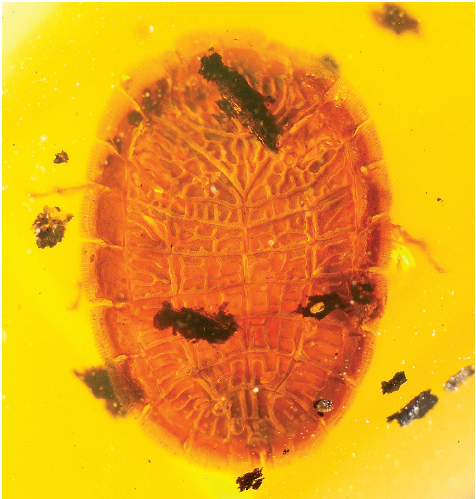
Figure 1. Termitaradus mitnicki sp. n. (KU DR-023), photomicrograph of female holotype, dorsal aspect (length of specimen 5.8 mm).

Holotype. ♀, KU-DR-023. Deposited in the Fossil Insect Collection, Division of Entomology, University of Kansas Natural History Museum, Lawrence, Kansas, USA.