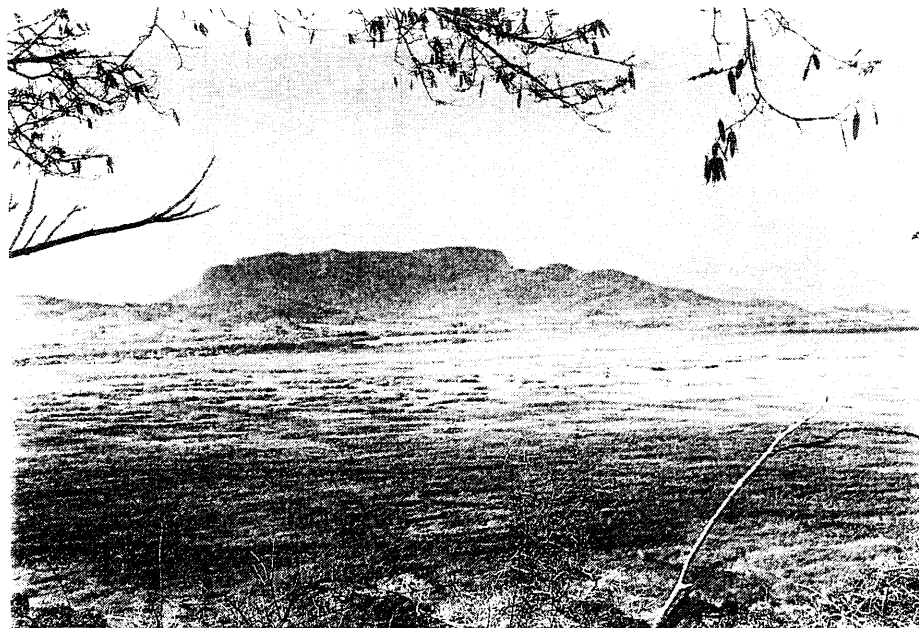
FIGURE 5.3. Laguna Palo Verde in February 2001. Since the mid-1980s, the diversity of both plants and waterfowl has declined dramatically, and the marsh has become choked with cattails ( Typha dominguensis, Typhaceae) and two aquatic perennial grasses, Hymenachne amplexicaulis and Paspalidium geminatum (Araceae).

a serious threat to the fauna in this region. Organophosphates and carbamates, the most common insecticides in use today throughout the world, are known as cholinesterase-inhibiting pesticides because they kill by interfering with the enzyme vital for nerve transmission. Organophosphates and carbamates work well against a wide range of insect pests and are often less expensive than many alternatives, which adds to their popularity. In addition to affecting insects, many are acutely (immediately) toxic to most vertebrates and other invertebrates. Because they break down quickly in soil and water, they often need to be applied to crops more than once during the growing season. Organochlorine insecticides, such as DDT, also are very effective in killing a broad range of insects; however, they are slow to break down, remain toxic for a considerable length of time, and accumulate in body fat. Additionally, the long-lived organic pesticides act as endocrine disrupters, mimicking naturally occurring androgens (estrogens), and may be detrimental to mammalian reproductive cycles—