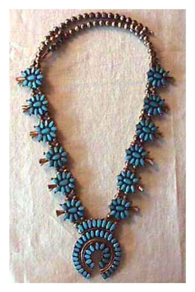
Turquoise Squash Blossom

Pawnshops have contributed to the loss of Navajo culture through the sale of sacred items left as pawn. Hundreds of pieces of turquoise jewelry, Navajo baskets, buckskins, and hand woven rugs sit in pawnshops all over the reservation. When items go dead pawn, tourists purchase them for top