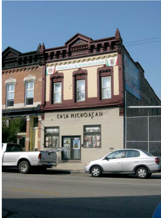
Casa Michoacán, Chicago, Illinois

Just southeast of downtown Chicago, near the once busy train tracks, an older building flanked by light poles with an eagle holding a serpent atop a nopal cactus hosts foreign dignitaries and English as a Second Language classes. In January 2004, with assistance from the FEDECEMI, the state government of Michoacán purchased the building located at 1638 Blue Island Avenue for the first Casa Michoacán. This space has become an exemplar michoacános hope to reproduce in other areas wherever there is a critical mass of michoacanos, such as Nevada, Texas, and California.