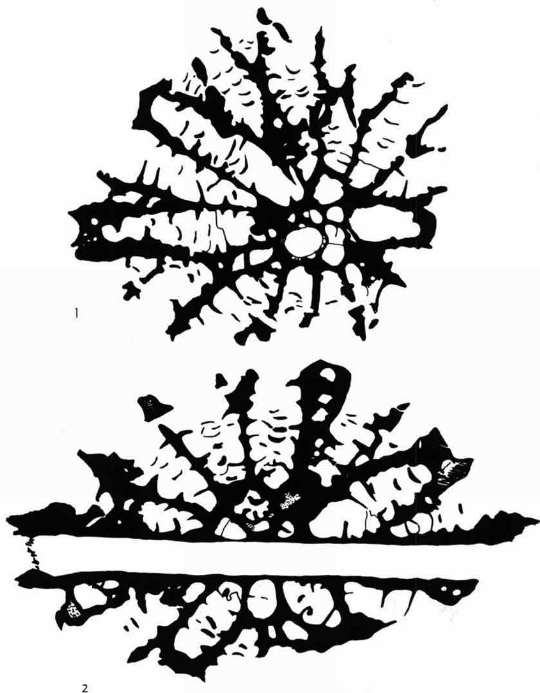
FIG. 3. Sutherlandia seminolensis COCKE & BOWSHER, n. sp., from Seminole Formation south of Glenpool, Tulsa County, Oklahoma.