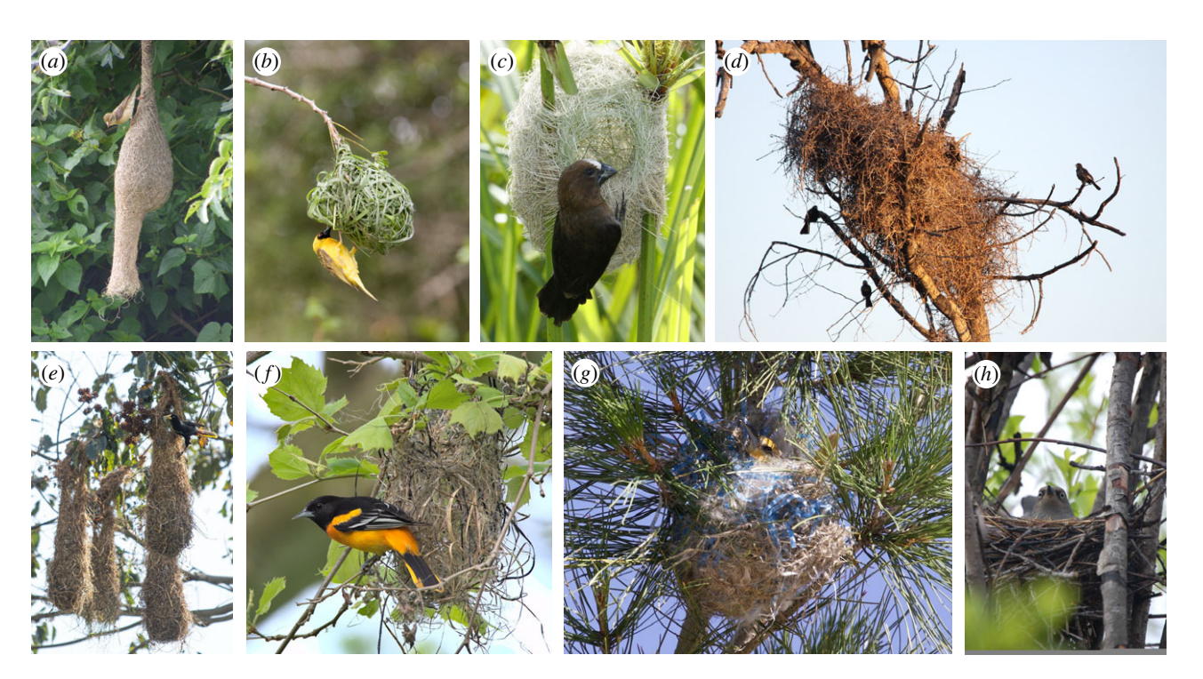
Figure 1. Examples illustrating the diversity of nest designs in weaverbirds (top row) and icterids (bottom row). ( a ) Baya weaverbird ( Ploceus philippinus ), ( b ) Southern masked weaver ( Ploceus velatus ), ( c ) Thick-billed weaver ( Amblyospiza albifrons ), ( d ) Red-billed buffalo weaver ( Bubalornis niger ), ( e ) Crested oropendola ( Psarocolius decumanus ), ( f ) Baltimore oriole ( Icterus galbula ), ( g ) Bullock's oriole (Icterus bullocki), ( h ) Rusty blackbird ( Euphagus carolinus ). Image credits: ( a ) Dr Raju Kasambe – CC BY-SA 3.0, https://commons.wikimedia.org/w/index.php?curid=19828748, ( b ) Chris Eason – CC BY 2.0, https://commons.wikimedia.org/w/index.php?curid=45087290, ( d ) Derek Keats – CC BY 2.0, https://commons.wikimedia.org/w/index.php?curid=45087290, ( d ) Derek Keats – CC BY 2.0, https://commons.wikimedia.org/w/index.php?curid=45087290, ( d ) Derek Keats – CC BY 2.0, https://commons.wikimedia.org/w/index.php?curid=45087290, ( d ) Derek Keats – CC BY 2.0, https://commons.wikimedia.org/w/index.php?curid=45087290, ( d ) Derek Keats – CC BY 2.0, https://commons.wikimedia.org/w/index.php?curid=45087290, ( d ) Derek Keats – CC BY 2.0, https://commons.wikimedia.org/w/index.php?curid=45087290, ( d ) Derek Keats – CC BY 2.0, https://commons.wikimedia.org/w/index.php?curid=45087290, ( d ) Derek Keats – CC BY 2.0, https://commons.wikimedia.org/w/index.php?curid=45087290, ( d ) Derek Keats – CC BY 2.0, https://commons.wikimedia.org/w/index.php?curid=45087290, ( d ) Derek Keats – CC BY 2.0, https://commons.wikimedia.org/w/index.php?curid=45087290, ( d ) Derek Keats – CC BY 2.0, https://commons.wikimedia.org/w/index.php?curid=45578683, ( h ) Robin Corcoran, USFWS – CC0, https://pixnio.com/fauna-animals/birds/blackbirds-pictures/female-rusty-blackbird-euphagus-carolinus-on-nest. All images have been edited only by cropping and re-sizing. (Online version in colour.)

largely on observational accounts and has yet to be investigated systematically in a phylogenetic comparative analysis.