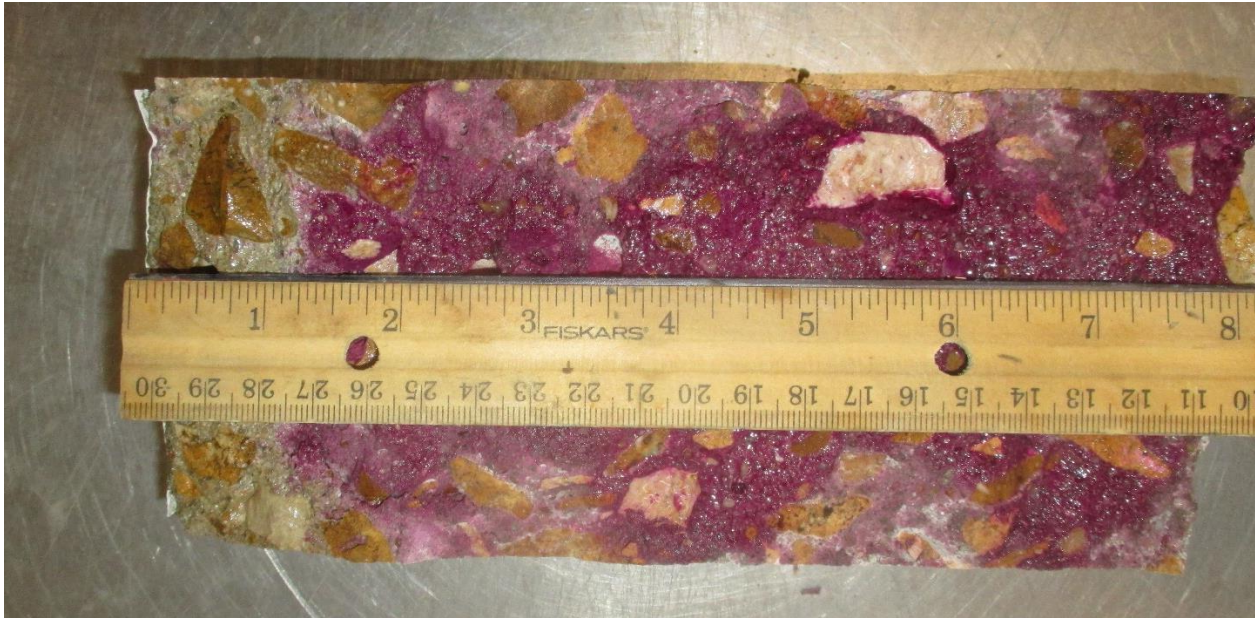
Figure 6: Carbonation depth for Core B4