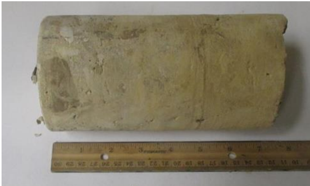
Figure 1: Core A4

This report details the analysis of three cores taken from Memorial Stadium on 08/17/22. Coring was performed by personnel from Wiss, Janney, Elstner Associates (WJE), and the cores were delivered to the KU Concrete Lab on the afternoon of 08/17. The cores were analyzed for chloride content and depth of carbonation, described later in this report. Core A4 (Figure 1) was taken from the east columns of the stadium, originally constructed in the 1920s. The core has an average length of approximately 7.5 in. Core B4 (Figure 2) was taken from the north stadium wall, also built in the 1920's, and has an average length of 8.5 in. Core C4 (Figure 3) was taken from the west columns of the stadium, built in the 1960s, and has an average length of 9.25 in. All three cores had an average diameter of 3.6 in.