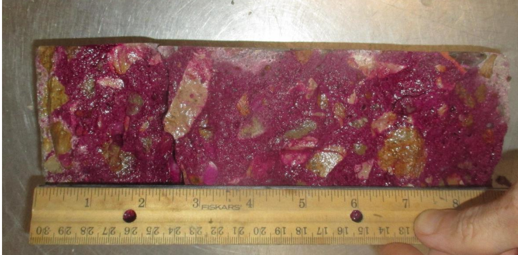
Figure 7: Carbonation depth for Core C4