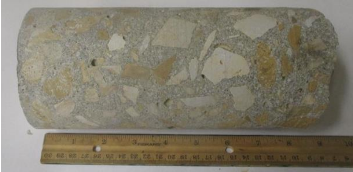
Figure 2: Core B4