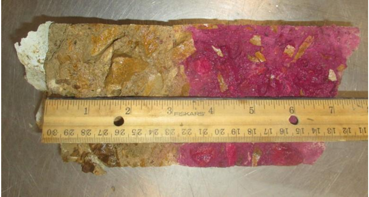
Figure 5: Carbonation depth for Core A4