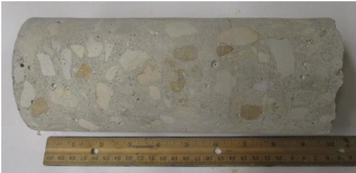
Figure 3: Core C4