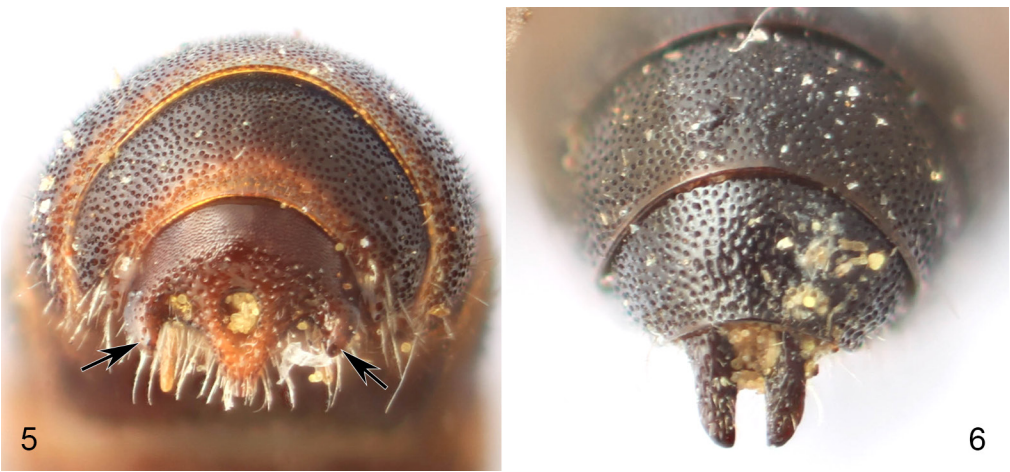
Figures 5–6. Male characters of Neochelostoma , new subgenus, and Foveosmia Warncke. 5. Seventh tergum of Chelostoma ( Neochelostoma ) tetramerum Michener, arrows indicate lateral projections. 6. Seventh tergum of C. ( Foveosmia ) distinctum (Stoeckhert).