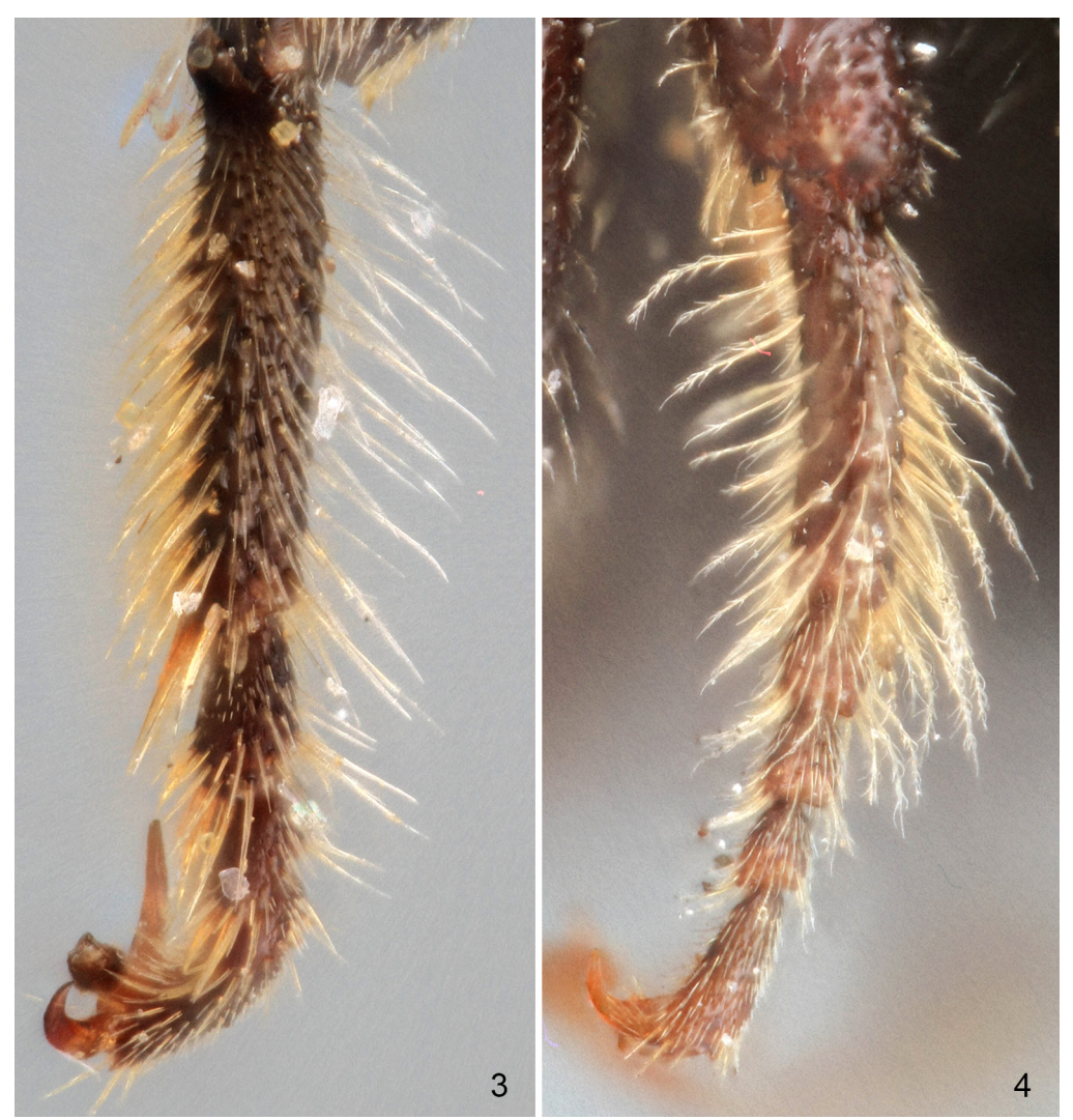
Figures 3–4. Female characters of Neochelostoma , new subgenus, and Foveosmia Warncke. 3. Probasitarsus of Chelostoma ( Neochelostoma ) californicum Cresson. 4. Probasitarsus of C. ( Foveosmia ) campanularum (Kirby).