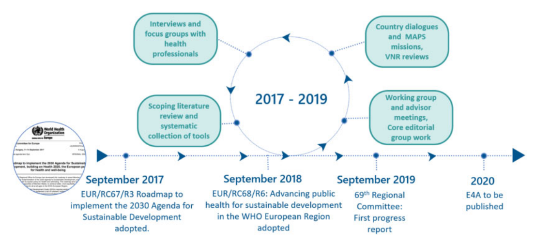
Figure 2 Timeline of the development of the E4A approach (World Health Organization Regional Office for Europe, 2019)

Development Group's SDG Acceleration Toolkit and the UN Development Programme's library was conducted, which returned \sim 800 tools. Two sets of criteria were then established for inclusion: (i) tools that were published in the last 5 years and (ii) tools that were deemed practical, useful for decision-making across different areas of health, supportive of actions and interventions to achieve SDGs and targets and that had the potential to accelerate implementation across the SDGs and targets. This resulted in a list of 400 tools, categorized by four WHO experts into (i) SDGs and target(s), (ii) the SDG Roadmap's strategic directions and enablers and (iii) stages of the policy cycle. Classification conflicts were resolved through consensus judgments. Third, in preparation of the first progress report on the implementation of the SDG Roadmap in 2019,<sup>3</sup> two additional reviews were undertaken on (i) SDG governance arrangements and health content as described in 43 Voluntary National Reviews (VNRs) conducted by WHO European Member States and (ii) the extent to which the actions taken in 20 countries, as described in their VNRs, align with the Roadmap's recommendations. 15 Fourth, an analysis on the status of each of the SDG 3 targets and on several other health-related SDG targets, their interconnectivity with other SDGs, available policy instruments, indicators and resources was conducted. 16,17