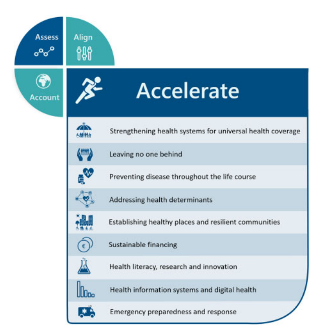
Figure 4 The proposed accelerators, partially derived from the SDG Roadmap (World Health Organization Regional Office for Europe, 2019)

Continuous and sustained efforts at alignment, often supported by policy dialogs within and beyond the health sector, promote policy coherence in implementation<sup>35</sup> and require institutional capacity and evidence-based knowledge. Important aspects, like health equity, gender and human rights, accountability and the outlook of young and future generations are important elements of alignment.<sup>6</sup> Alignment has been recognized as critical to advancing health through a number of global legally binding instruments and UN resolutions or common positions, including for example the global implementation of the Framework Convention on Tobacco Control,<sup>36</sup> the International Health Regulations and agreements on both communicable diseases and NCDs, most recently through the UN Common Position on Ending HIV, TB and Viral Hepatitis.<sup>37</sup>