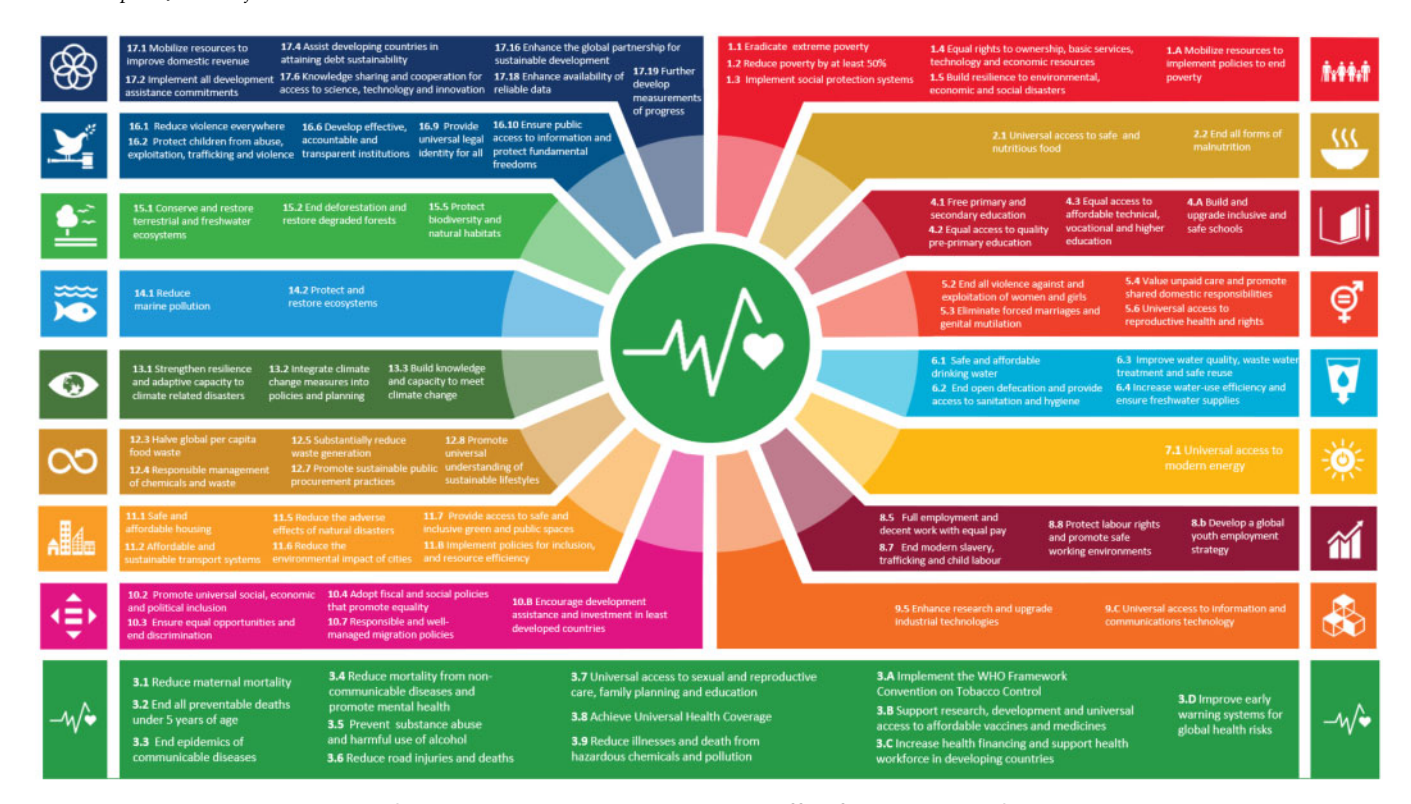
Figure 1 Health-related SDG targets (World Health Organization Regional Office for Europe, 2019)

immunization rates, tackling risk factors like obesity, alcohol, tobacco use and air pollution, addressing mental health disorders and reducing interpersonal violence.<sup>3</sup>