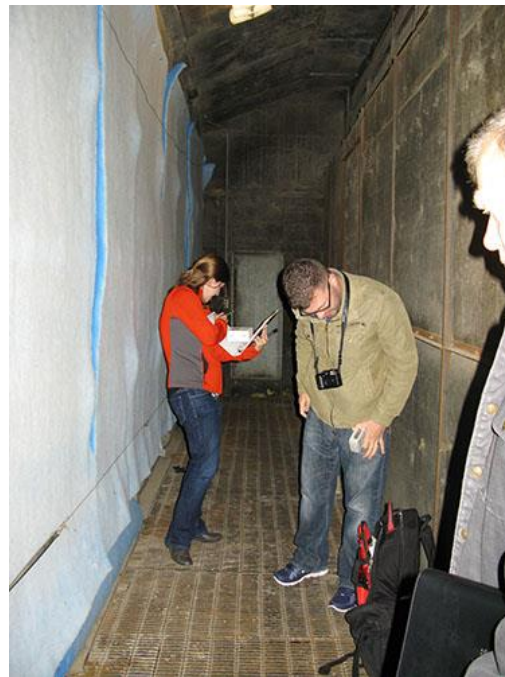
Left: Entering Spencer Research Library's mechanical room.