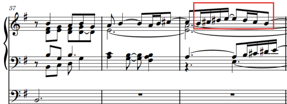
Figure 4: Entrée , mm. 57–9 showing the raised fourth scale degree.

The pedal melody was also the most obvious problem in this movement's transcription. While itself easy to transcribe, the melody covered up the sound of the manual playing, meaning that a significant amount of the lower manual work had to either be written entirely new or based on a few fleeting bass notes. Several contextual clues enabled these decisions to be made in an informed manner. When the pedal was not playing, the manual notes were easier to hear, thus allowing me to check whether or not the previous passages made sense as to their range and texture. The peculiar breaks of the mixture stops on the Notre Dame organ also made certain notes project from the texture (especially soprano D); I used these notes as signposts to help with range and texture issues as well. When it was impossible to discern either aurally or contextually the notes used for a particular passage, I took what I knew about Cocherneau's musical and tonal language and wrote a passage based on what would be feasible and musical to play on an organ, while attempting to be contrapuntally correct and informed by Cocherneau's musical and tonal language (Figure 5). In any case, every attempt has been made to preserve the notes exactly as they were played.