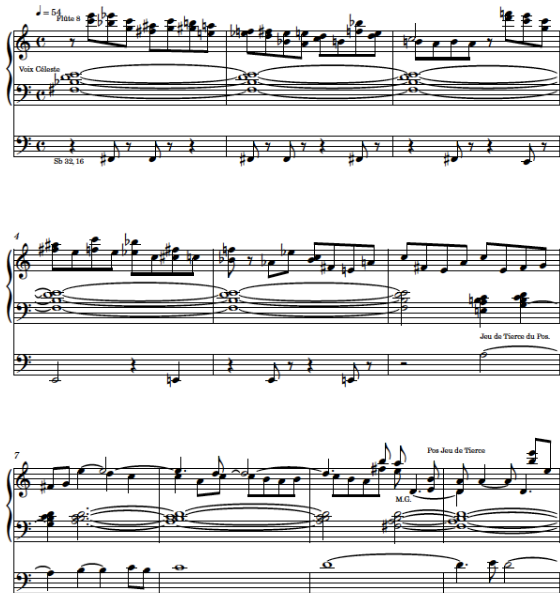
Figure 6: Offertoire , mm. 1-10, showing the texture, different sounds, and the beginning of the melody in the pedal.

This movement presented several unique challenges, the most significant of which was the fact that Cochereau almost certainly used the Notre Dame organ's unique coupure pédale , the "pedal-divide" which enables the organist to play two different musical lines with two different sounds on the pedals. This unique device is not present on most organs, and thus a solution was required that would enable this passage to still be playable by a single person. To