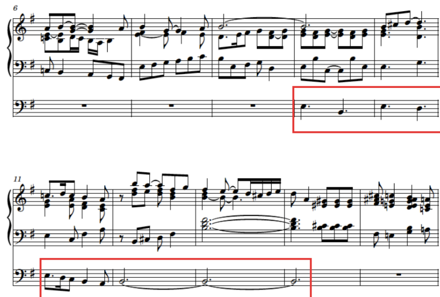
Figure 2: Entrée , mm. 6–15 showing the pedal melody.

The Entrée is the piece during which the clergy and other members of the liturgical procession enter the church. With Cochereau at the organ these often took the form of loud boisterous movements that utilized the organ's powerful en chamade stops, 32 and this selection is no exception. Its most prominent feature is the roaring and blaring pedal melody, which repeats in various ways throughout the short movement (Figure 2).