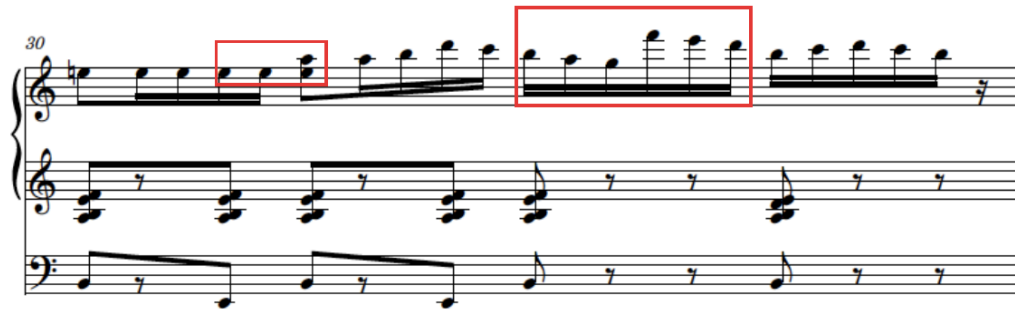
Figure 11: Sortie , mm. 30 showing various range issues.

Cochereau was quite consistent in his observance of meter, but on occasion he added extra beats or extra half-beats, which are notated with extra measures. Another surprising challenge involved determining the range of some of the passages (Figure 11).