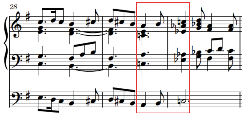
Figure 3: Entrée , mm. 28–30 showing pivot motion from A minor to A-flat major using C as a common tone.

This draws a parallel with the earlier French classic Plein jeu , especially of De Grigny, in which a loud solo melody (usually a chant) could be played in the pedal with manual accompaniment upon the keyboard plenums (exactly what transpires here). I have been unable to identify any pre-existent tune that could form the basis of this melody, so I worked under the assumption that it, too, was improvised. Accompanied by the organ's full plenum, 33 this jaunty piece in triple meter serves to open the suite with an energetic fanfare. Here, Cochereau uses pivot motion (Figure 3), featuring abrupt changes of harmony built around a single note. 34 Cochereau also favored the augmented fourth scale degree, a Lydian inflection, in some of the melodic and harmonic passages (Figure 4). Rhythmically, Cochereau expertly manipulates the many possibilities inherent in triple meter, playing with suspensions, dotted rhythms, and delayed rhythmic cadences.