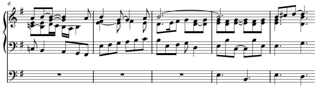
Figure 5: Entrée , mm. 6–10. This is one spot (mm. 9–10) where the left hand (middle staff) was difficult to hear.

The Offertoire (the preparation of Holy Sacrament) is a softer movement focusing mainly on the organ's string and flute stops. Cochereau aims for a dreamy atmosphere with chords and patterns that are built upon the octatonic and whole-tone scales. He also favored the added-sixth chord and highly-chromatic motion. The harmonic flute stop in the right hand serves as a counter-melody to the main melody, which is played on a jeu-de-tierce combination. 35 Cochereau inserts the interval of a fourth in the counter melody, and some ornamentation in the main melody. This is all accompanied by a mysterious pulsating bass provided by the lowest pipes in the pedal division. The main melody seems to wander, giving rise to the suspicion that it again was freely improvised and not based on a pre-existing cantus firmus .