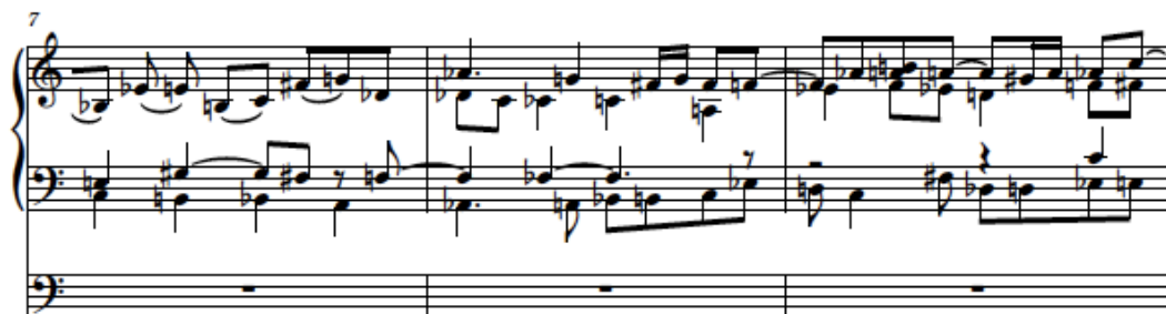
Figure 8: Communion , mm. 1-9, first fugal entry section.