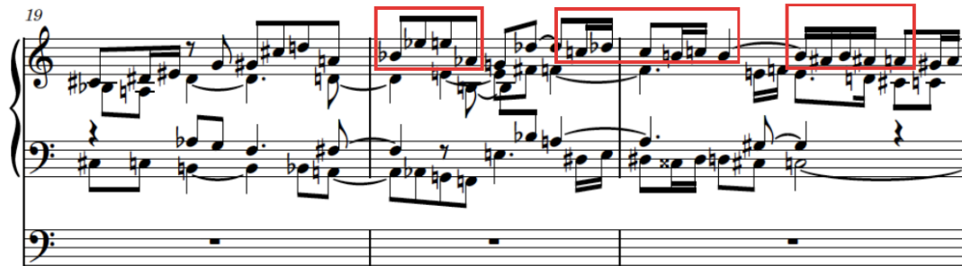
Figure 7: Communion , mm 19-21 showing Cochereau's octatonic tendencies.