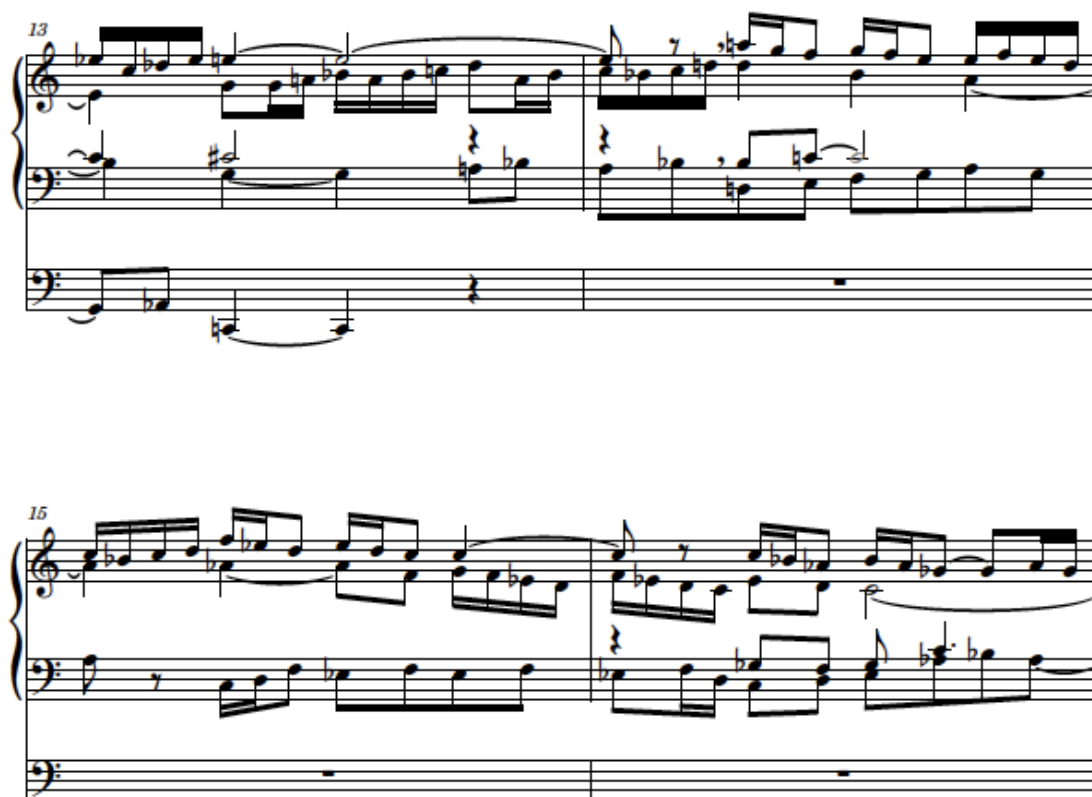
Figure 9: Communion , mm. 13–16, a fugal episode, some pitch assumptions.

The most significant issue encountered during the transcription of the Communion was being able to hear the middle voices. At certain points (Figure 9) pitch assumptions had to be made in order to avoid parallel motion and fill the texture from what could not be heard. The pedal was difficult to hear due to the low register and choice of registration.