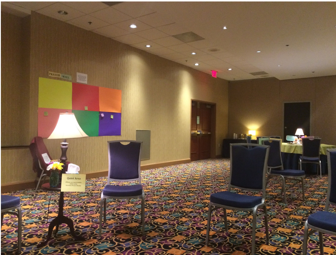
Figure 5: “Quiet Area” and “Prayer Wall” at The Reformation Project’s regional training conference in Atlanta in June 2015.

I stopped by the prayer room on my way to the opening evening of TRP’s regional training conference in Atlanta in search of a quiet place to clear my head and reflect after a long day participating in the Academy for Racial Justice. The prayer room was tucked away in a smaller conference room just outside of the main meeting space in between the registration area and the book table. I sat for a few minutes in the quiet area, gazed tiredly at the prayer wall, and entertained a thought about what my prayer would be if I had one. Since it was the first day of the conference, there were only five handwritten