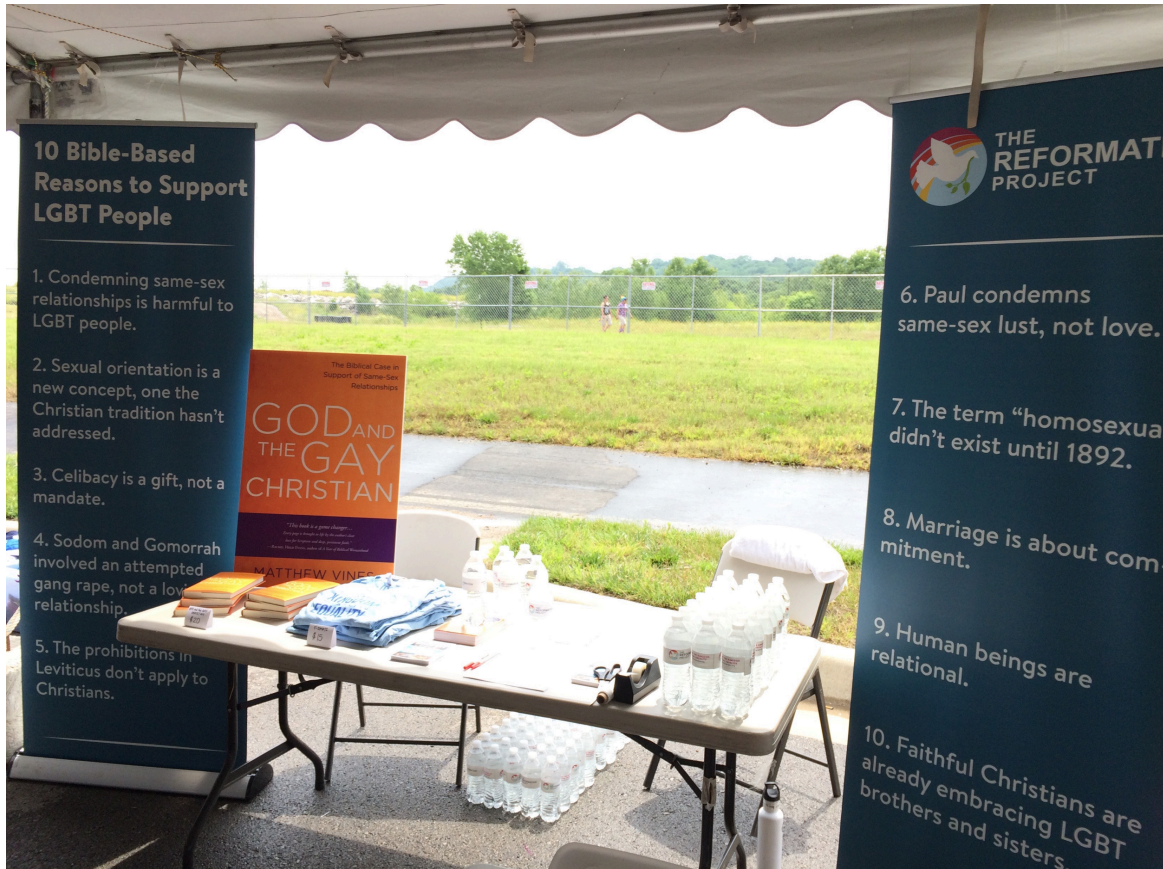
Figure 3: A version of the talking points on display at Kansas City PrideFest on June 5, 2015.

“Clearly, traditionalist or non-affirming or non-inclusive beliefs about same-sex relationships and transgender identity do contribute to bad fruit in LGBT people’s lives” in terms of, he suggested, family rejection and an increased likelihood of attempted suicide, depression, and drug use.