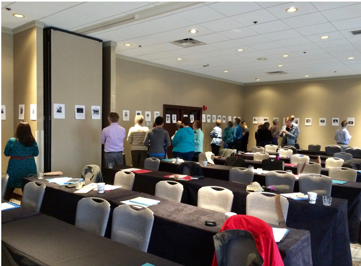
Figure 6: Academy for Racial Justice participants touring the Racial Justice and LGBT Equality Timeline at The Reformation Project’s regional training conference in Kansas City on November 5, 2015.

biases that contribute to and perpetuate shared oppression. According to TRP’s Academy program, the goals of the exercise, also adapted from the previous iteration of the timeline, were to “understand the systematic and institutionalized oppression of targeted communities and its impact”; to “identify the common strategies used to exclude and marginalize targeted communities”; and to “build awareness and common ground between communities.”