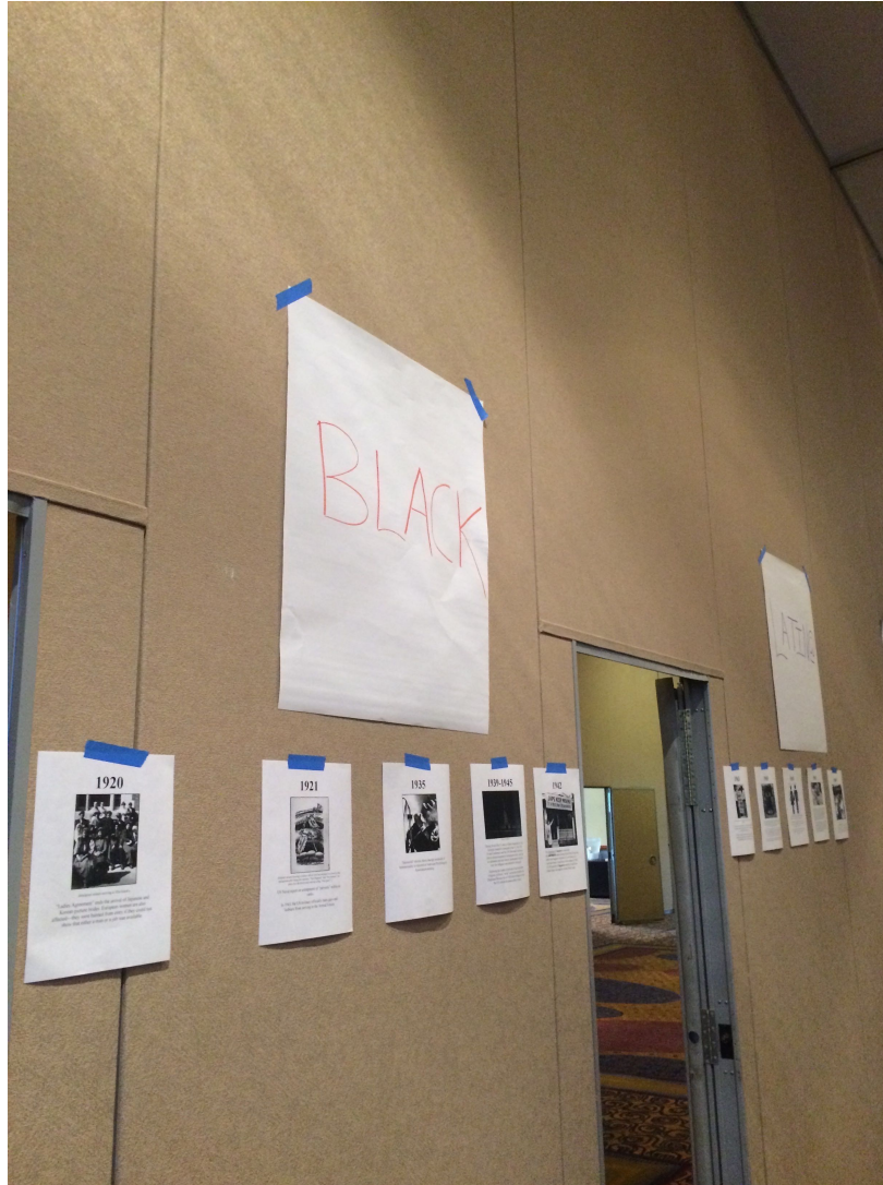
Figure 1: Caucus topics above the Racial Justice and LGBT Equality Timeline (see chapter five) at The Reformation Project’s regional training conference in Atlanta in June 2015.

greater LGBTQ inclusion? Or, do they want to begin with a working session, then fellowship over dinner later?”