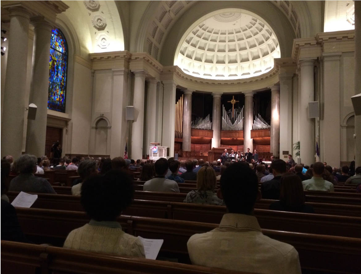
Figure 2: Conference attendees singing hymns and worship songs at The Reformation Project’s regional training conference in Washington, DC, in November 2014.

If the leadership-development training programs are the backbone of TRP’s work, the regional training conferences constitute a more streamlined version of the leadership-development training for a bigger audience. 282 Attendance ranged from two to four hundred at the three conferences I attended. Although the regional training conferences also include worship, panel discussions, keynote presentations, and opportunities to fellowship, the centerpiece of the conferences is the instruction and coaching of a series