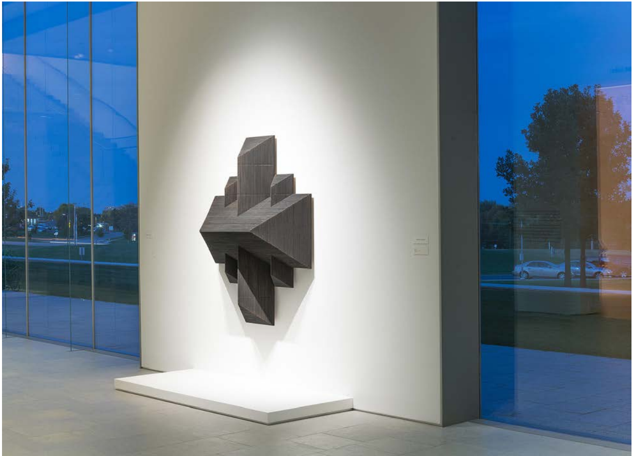
May Tveit, Look Up , 2017, corrugated cardboard, glue, graphite, 66 x 55 x 16 in.