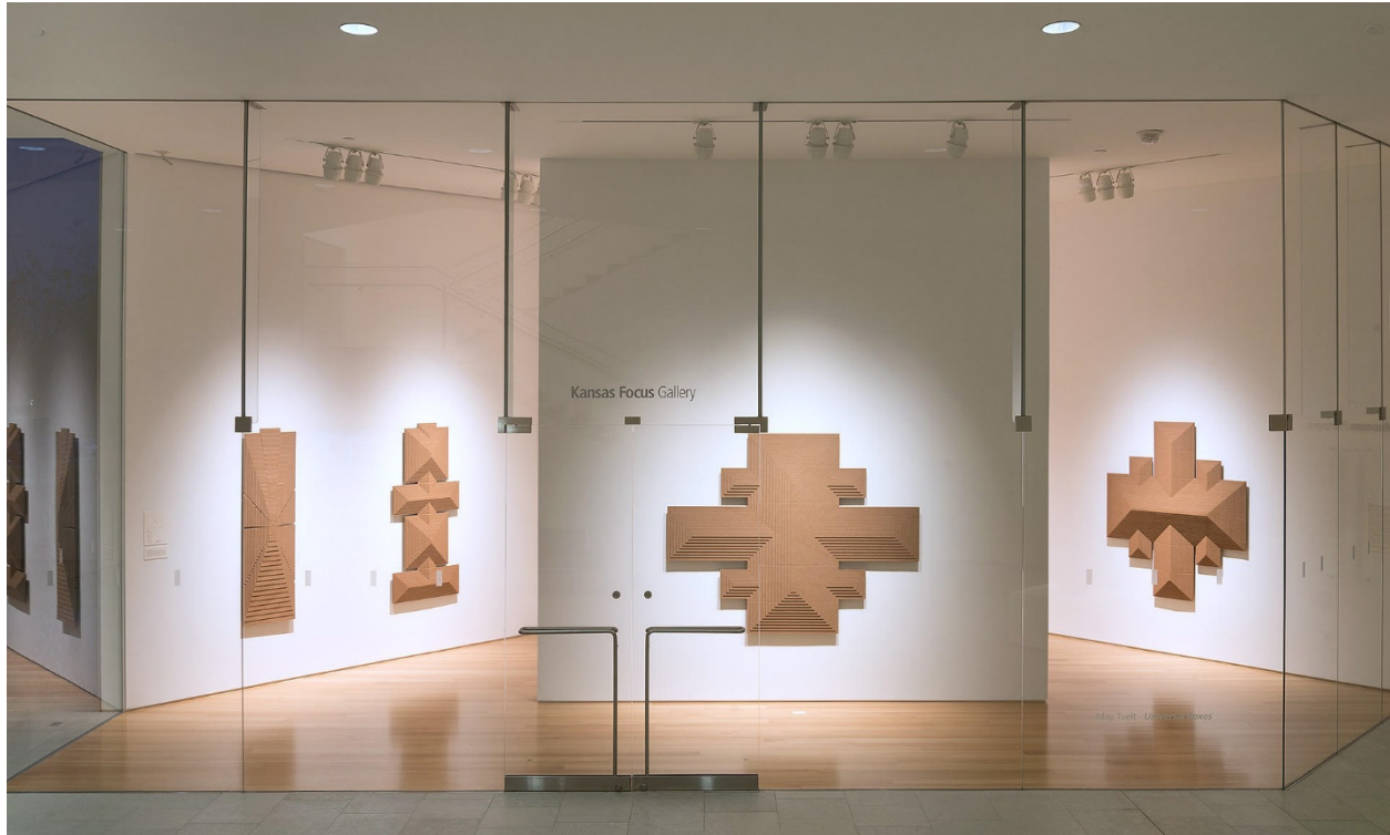
Installation view, "May Tveit: Universal Boxes." Left to right: The Well , 2017, corrugated cardboard, glue, 68 x 19 ¼ x 3 ½ in., The Road , 2017, corrugated cardboard, glue, 68 x 29 ½ x 4 in., You and Me , 2017, corrugated cardboard, glue, 66 x 83 x 3 in., The Window , 2017, corrugated cardboard, glue, 68 x 55 x 5 ½ in.