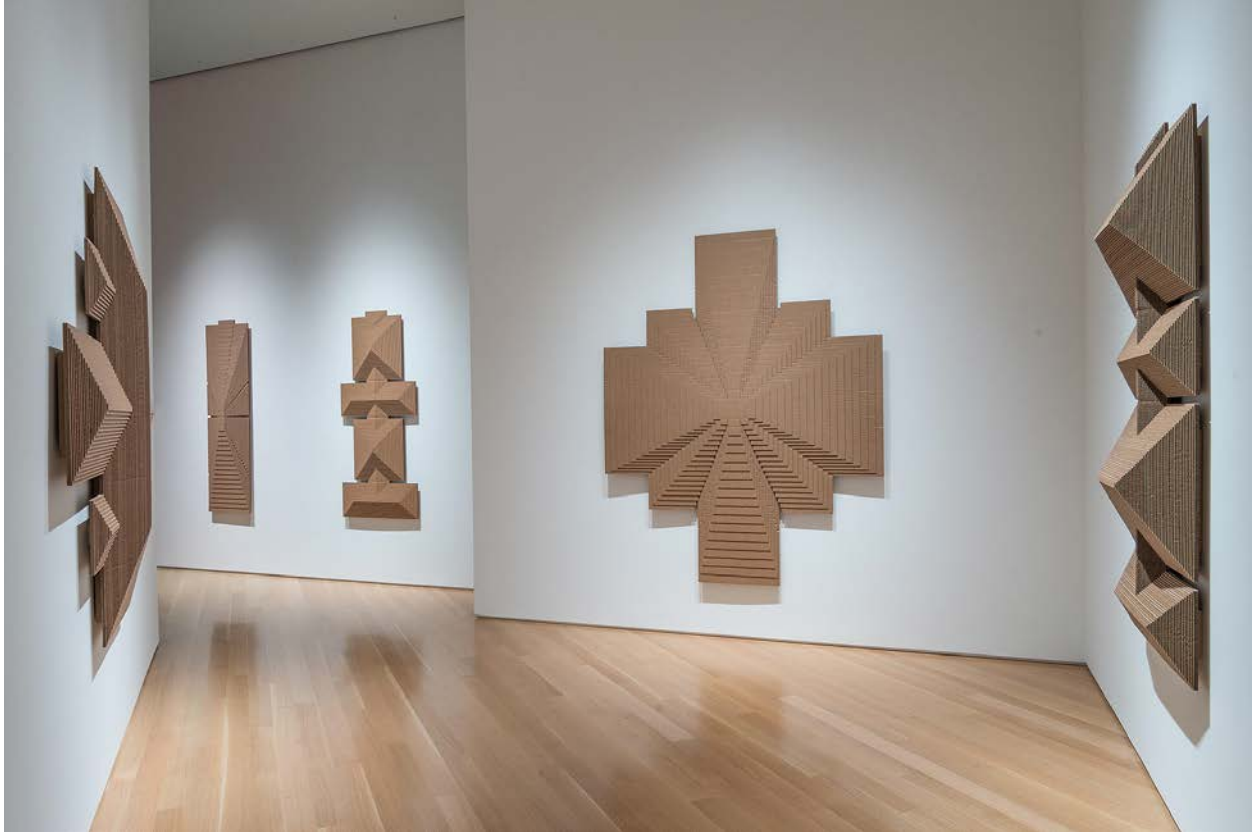
Installation view, "May Tveit: Universal Boxes." Left to right: Me and You , 2017, corrugated cardboard, glue, 66 x 83 x 5 in., The Well , 2017, corrugated cardboard, glue, 68 x 19 ¼ x 3 ½ in., The Road , 2017, corrugated cardboard, glue, 68 x 29 ½ x 4 in., Say Yes , 2017, corrugated cardboard, glue, 85 x 68 x 3 in., Purgatory , 2017, corrugated cardboard, glue, 68 x 32 ½ x 7 in.