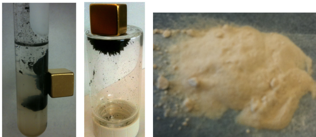
Figure 2. (a) Sequestration utilizing catalyst-activated Nb-tagged Co/C, (b) spent magnetic oligomer and (c) Nb-tagged Si-particles.