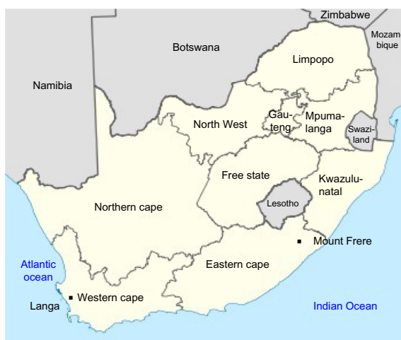
Figure 1 Study Sites: Langa, Western Cape Province, and Mount Frere, Eastern Cape Province, South Africa.

We will align PURE THM study with the larger PURE study. We will collect data once a year and there is data collection