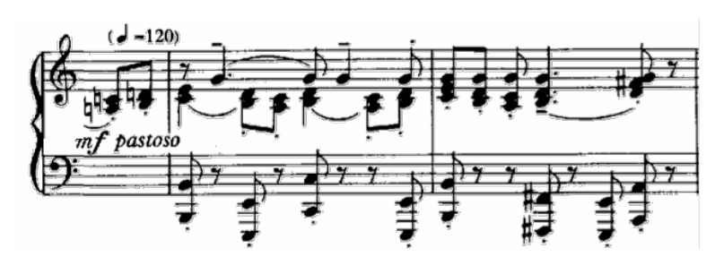
Ex. 9. Persichetti, Piano Sonata No. 9, I, mm. 28-30.

short, simple motives with hints of melodic interest. Melodies are found not just in the top most voice, sometimes in inner voices as well. The melodies often have varied presentation, with inspiration of quartal harmonies and fourths (see Ex. 7 above), jazzy syncopated rhythm (Ex. 9), or as simple as a broken chord (see Ex. 8 above).