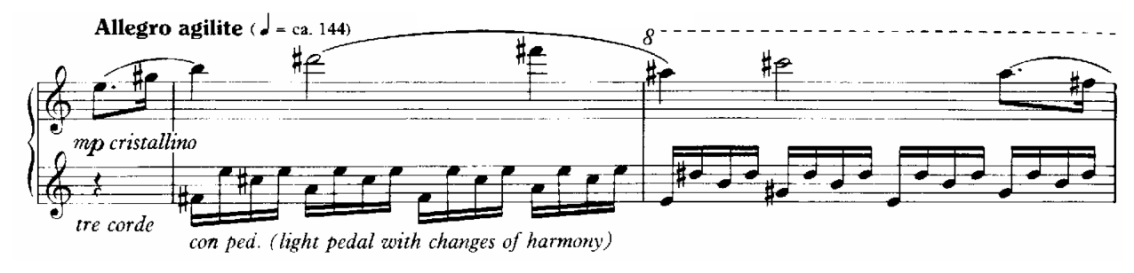
Ex. 8. Persichetti, Piano Sonata No. 9, II, mm. 113-15.

Piano Sonata. The last movement kicks off with a polychord that combines an F-major triad and an F-sharp major triad. Further, the chord spacing in the bass clef is much wider than that of right hand. Persichetti believes a chord gains greater resonance with this arrangement of chord spacing. The refrain of the double-variation form in the second movement is harmonically interesting. For instance, the first two measures can be analyzed as a polychord of a lingering melody of E^{maj13} in treble clef against F^{\#}m^{7} and E^{maj7} in the bass clef. These two measures can also be analyzed as two individual extended chords of F^{\#}m^{13} in measure 114 and E^{maj13} in measure 115 (Ex. 8). Nonetheless, I am more convinced that Persichetti intended to create a poly-harmony effect. First, Persichetti gives performers a pedaling direction, "light pedal with changes of harmonies." Moreover, polychords are seen more obviously in the later measures. Within the same section, there are very prominent appearances of polychord, for example, polychords of B major seventh/G major seventh, and C-sharp minor/F major in measure 120.