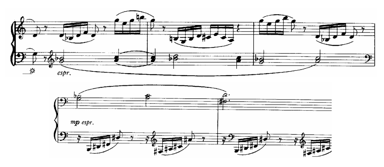
Ex. 11. Persichetti, Piano Sonata No. 9, II, mm. 124–26 (above), and mm. 143–44 (bottom).

Piano Sonata exhibits the sensitivity of the composer to deviate from our common practice in formal designs. However, Persichetti is able to create a feeling of "inevitability of form" at the same time.<sup>44</sup>