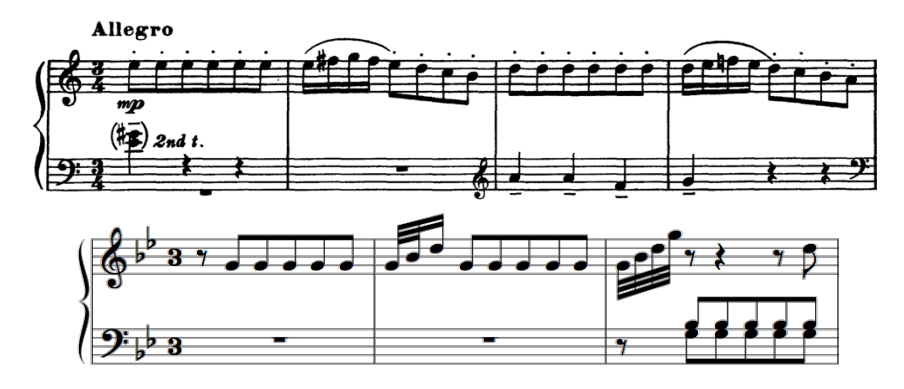
Ex. 1. Persichetti, Capriccio from Little Piano Book, Op. 60, mm. 1-4 (above); Rameau, La Poule, mm. 1-3 (bottom).

No. 4 Masque is one of the most vigorous pieces among the whole set. It evokes a scene of the masked ball in Europe, a courtly entertainment that flourished in the sixteenth to early seventeenth centuries. Persichetti requires the performer to repeat the entire Masque twice. The dynamic of the piece reduces gradually towards the end, as if the masque participants are departing. No. 6 Arietta is an unmeasured piece, indicated with Alla recitativo and espressivo (Ex. 2). Persichetti leaves pianist a high degree of freedom to perform it. This piece combines singing and speaking quality as notated in the title and tempo marking. It is constructed upon a descending bass line. Arietta is a good introductory piece to teach legato playing, singing style, and elements of opera or stage works. No. 7 Humoreske shares the same title with the compositions by Robert Schumann and Antonín Dvořák, but they are completely different from each other. It is a short, blithesome piece with frequent changes of melodic contour.