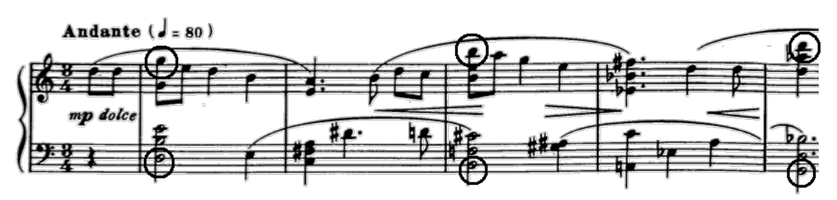
Ex. 12. Persichetti, Poems for Piano, Vol. 1, No. 2, mm. 1-5. Unfolding of G major triad in outer voices.