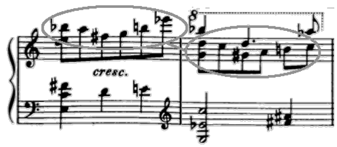
Ex. 15. Persichetti, Poems for Piano, Vol. 1, No. 2, mm. 14-15. Imitation of the U-turn figure in middle voice.