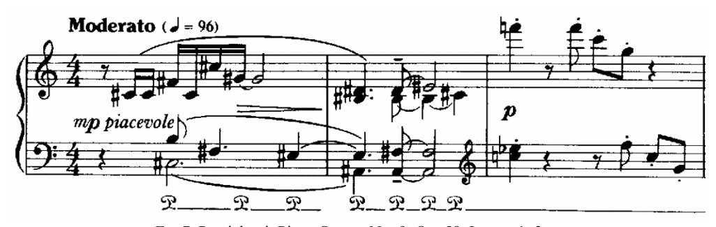
Ex. 7. Persichetti, Piano Sonata No. 9, Op. 58, I, mm. 1-3.

Quartal chords are prevalent in the Ninth Piano Sonata. Indeed, the interval of the fourth plays a significant role in this sonata. The first movement starts with fourths and quartal harmonies (Ex. 7). These notes together create a strong sense of a pentatonic scale, hence, a taste of the oriental as described by Persichetti (Ex. 7, m. 3).<sup>31</sup> The interval of a fourth stands out in the beginning of the third movement, where the melodic line outlines this particular interval.