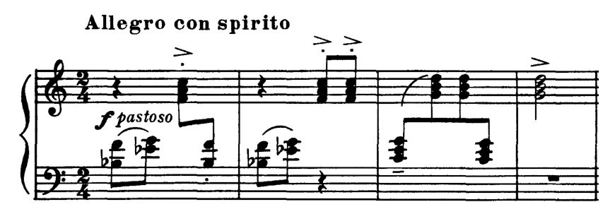
Ex. 4. Persichetti, Fanfare from Little Piano Book, Op. 60, mm. 1-4.

is also an outstanding piece to demonstrate the sound of polychords (discussed below). No. 9 Interlude and No. 12 Epilogue are sluggish pieces but soft in dynamic. The Interlude is composed with two staves of treble clef, at a relatively high register. The Epilogue is a mourning piece with chordal writing, emphasizing the inner voice in the last four measures.