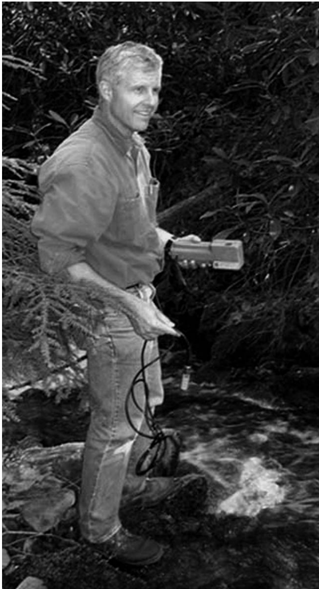
Figure 1. Patrick J. Mulholland (1952–2012), leader of the Lotic Intersite Nitrogen eXperiments (LINX).

physical data set (Zhang et al. 1999, Hubbard et al. 2013) through collaboration across the disciplines of hydrology, ecology, geography, and modeling. Collaboration between ecophysicists and hydrologists addressed the fate of water use by vegetation (Brooks et al. 2009). A large cross-continent experiment on terrestrial nutrient enrichment (NUTNET) has provided broad and general results (Borer et al. 2014). Like LINX, these studies were able to address large-scale scientific questions by applying disciplinary expertise to interdisciplinary problems through focused collaborative effort.