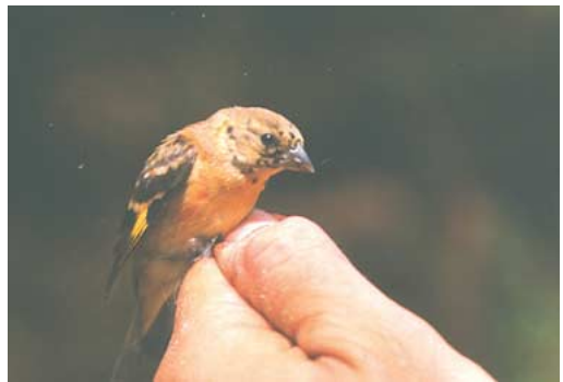
FIG. 3. Immature male Red Siskin that was no more than a few months old. In addition to the obvious black feathers on the head this individual had patches of orangish-red throughout the entire body. Photographed November 2000 by M. Robbins.

At the original discovery site, the April 2001 breeding season appeared more advanced than in April 2000, because a newly fledged juve-