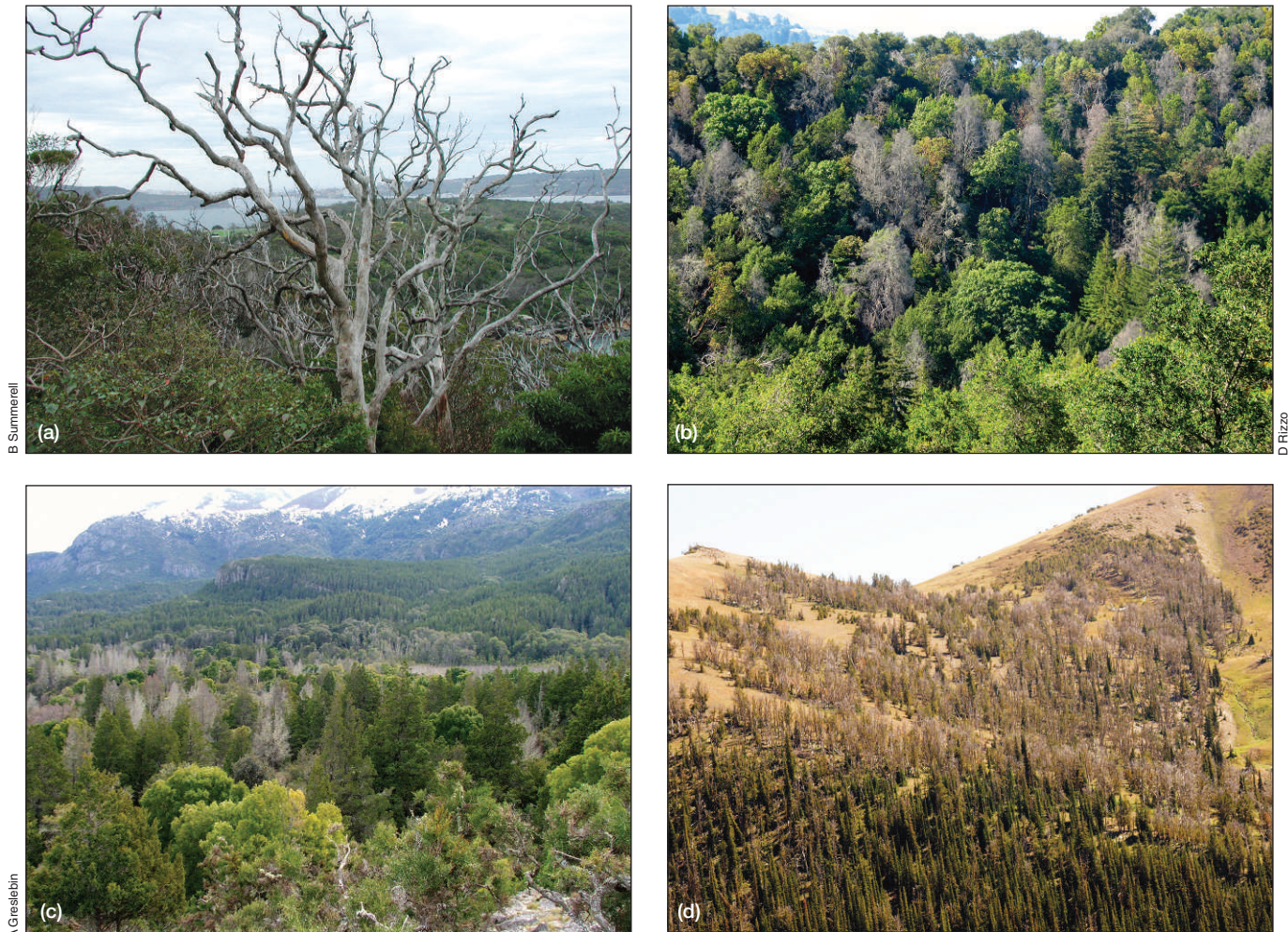
Figure 2. Examples of dieback from different forest types around the world. (a) Eucalyptus ( Eucalyptus spp) killed by jarrah dieback ( Phytophthora cinnamomi ) in Australia. (b) Oaks and tan oaks ( Quercus spp and Notholithocarpus , respectively) killed by sudden oak death ( Phytophthora ramorum ) in California. (c) Ciprés de la cordillera ( Austrocedrus chilensis ) killed by Phytophthora austrocedrae in Argentina. (d) Whitebark pine forest ( Pinus albicaulis ) killed by non-native white pine blister rust ( Cronartium ribicola ) in the Willowa Mountains of Oregon.

lauricola ), which were probably originally introduced into the US via wood packing materials from Asia (Mayfield and Thomas 2009). This insect–fungus association is presently attacking a wide range of native and managed hosts in the laurel family (Lauraceae) in the southeastern US, including avocado ( Persea americana ) plantations, where the losses could reach as high as US$356 million (Evans et al. 2010). The speed of native forest loss has been notable; in less than 1.5 years, mortality in native redbay trees ( Persea borbonia ) alone was 70% (Fraedrich et al. 2008). At least 14 other woody native members of the Lauraceae in the southern US and California, including some that are used as urban shade trees, are likely to suffer mortality as these pests spread (Peña et al. 2012).