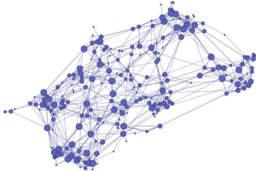
Fig 1. Study 2: Network representing out-degree (i.e., the number of friends a participant claimed) for Year 11 participants at a boys' school in Australia. Note. Every participant is represented as a node and the size of the node represents the number of friends that were listed by participants. Connections between nodes indicate interpersonal ties. N = 161 .