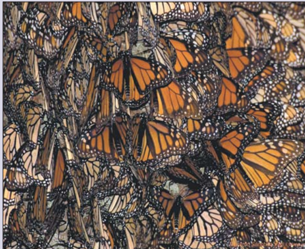
The monarch butterfly ( Danaus plexippus ) is one of the best known of all North American butterflies due to its multi-generational migrations across North America.