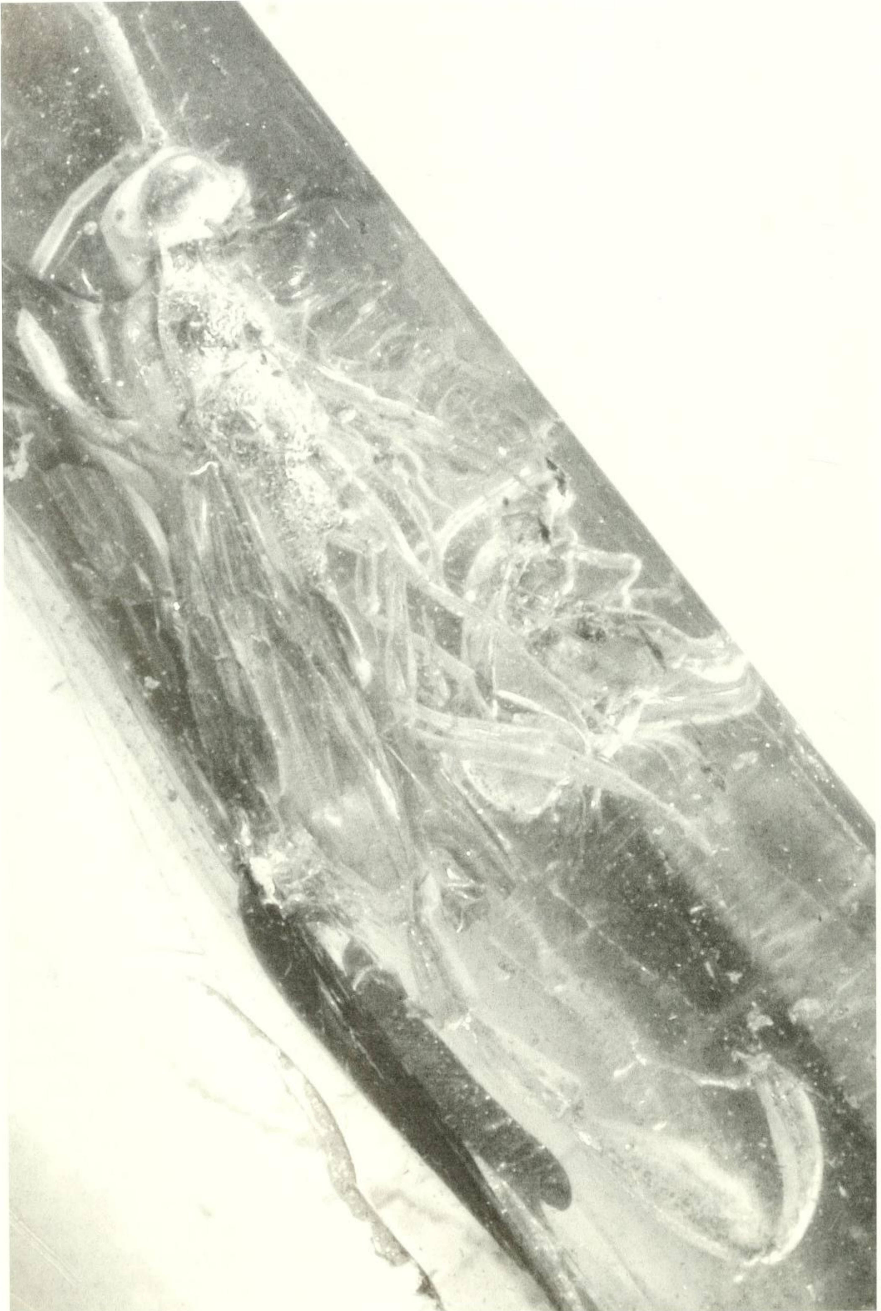
Fig. 1. Photomicrograph of Pelecinopteron tubuliforme Brues (AMNH).