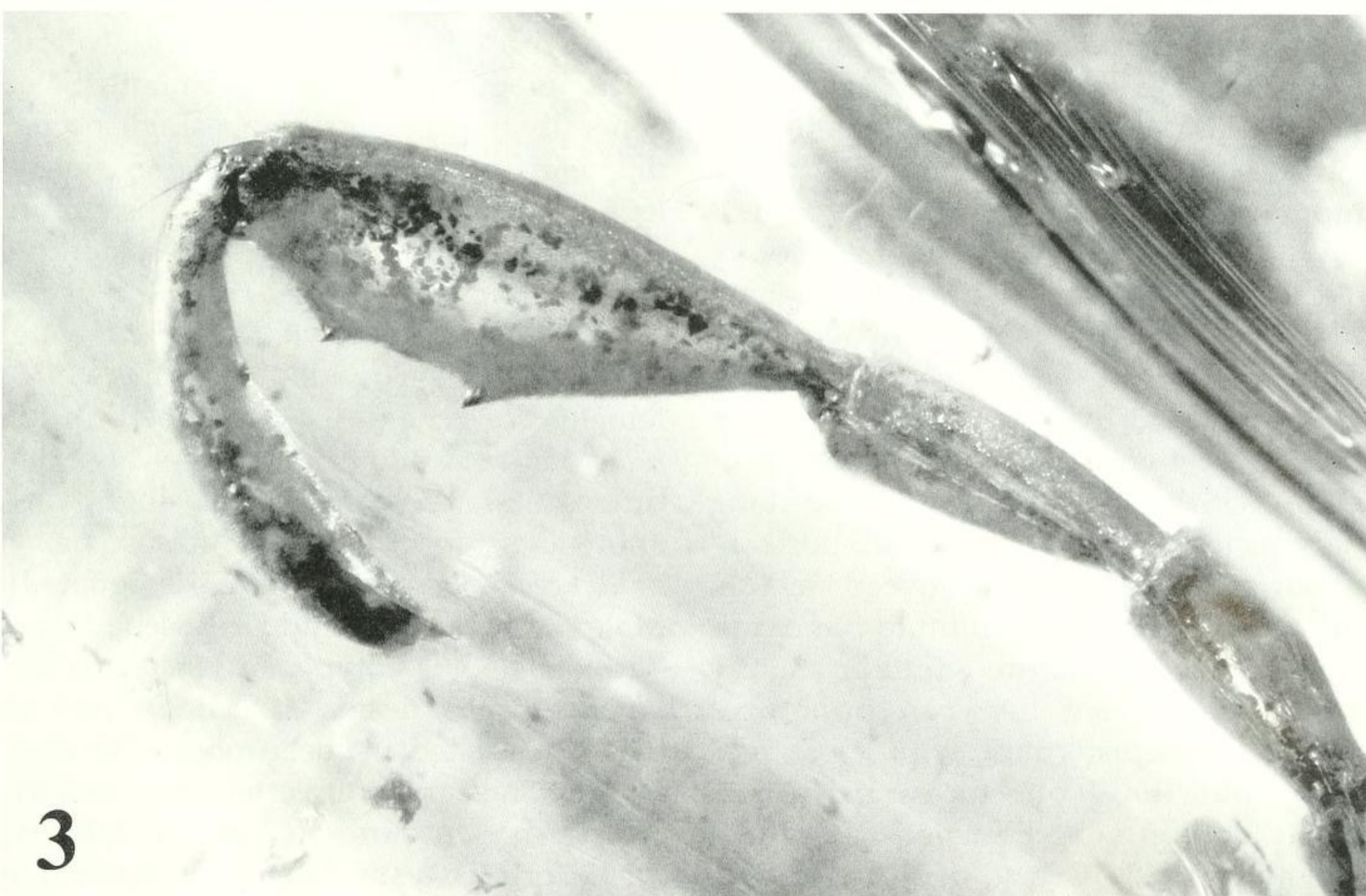
Figs. 2-3. Photomicrographs of Pelecinopteron tubuliforme Brues (AMNH). 2. Lateral view of mesosoma and head. 3. Lateral view of distal metasomal segments (from left to right = segments 7, 6, 5, 4, and apex of 3).