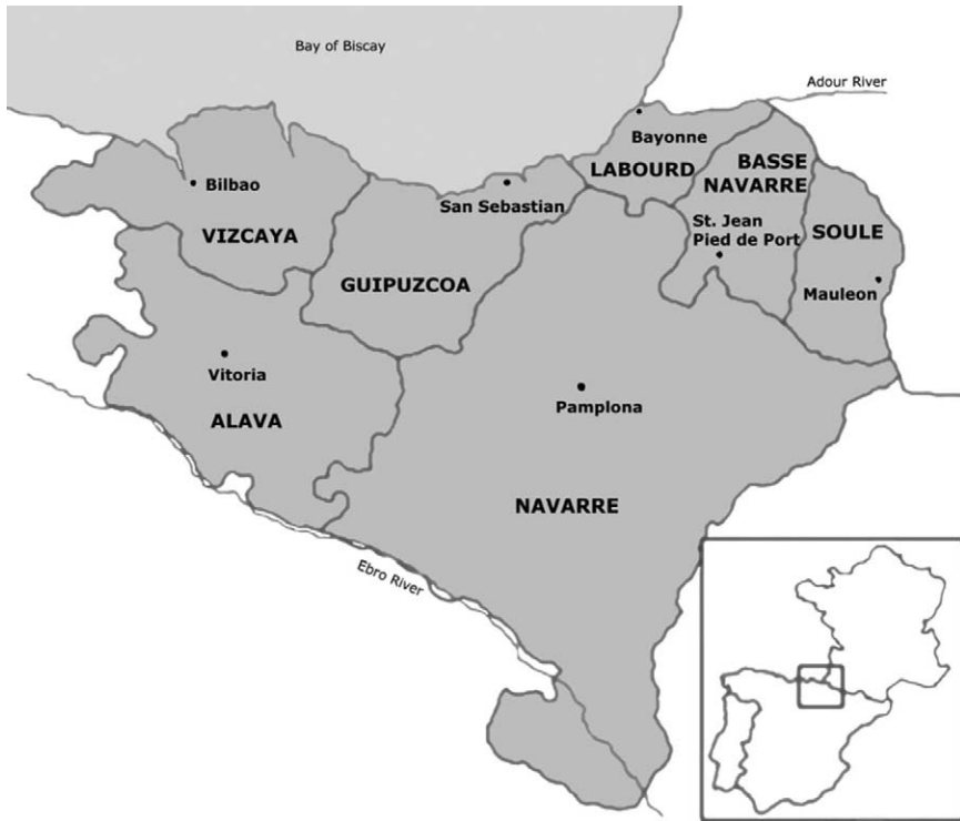
Figure 1. Map of Basque provinces in Spain and France, with locations of provincial capitals highlighted.