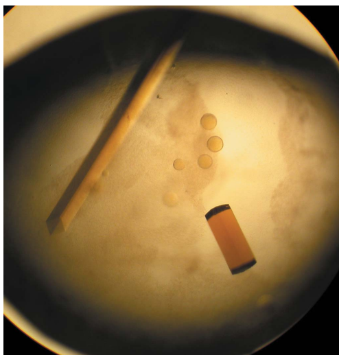
Figure 2 Crystals of unsubstituted recombinant HADH grown in 0.1 M HEPES buffer pH 7.4 containing 2.0 M ammonium sulfate, 2% (v/v) PEG 400 and 4% (v/v) glycerol. The crystal to the left is a square rod like those used to collect data, while the crystal on the right is one of the square 'pizza-box' crystals viewed edge-on.

Recombinant unsubstituted HADH was overexpressed in E. coli BL21 (DE3) Rosetta strain. The Rosetta strain was used as hadh has a high GC content (>85%) with a number of rare codons in the sequence. Expression using this system yielded ~25 mg purified protein per litre of E. coli culture. Expression in the methionine-auxotrophic E. coli strain B834 (DE3) reduced the yield to ~1/10 of that obtained using Rosetta expression. In order to ensure that the resulting enzyme had a full content of 6-S-cysteinyl-FMN and [4Fe-