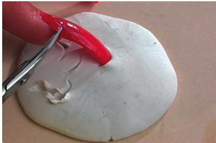
Figure 9 Mika Rottenberg. Video still from Mary's Cherries . 2004.

in a multi-story production line to transform bright red fingernail clippings into maraschino cherries (Figure 9). Rottenberg's piece is disturbingly humorous and creates a bizarre site for viewers to question bodily purpose and systematic dysfunctionality (Figure 10). Rottenberg's