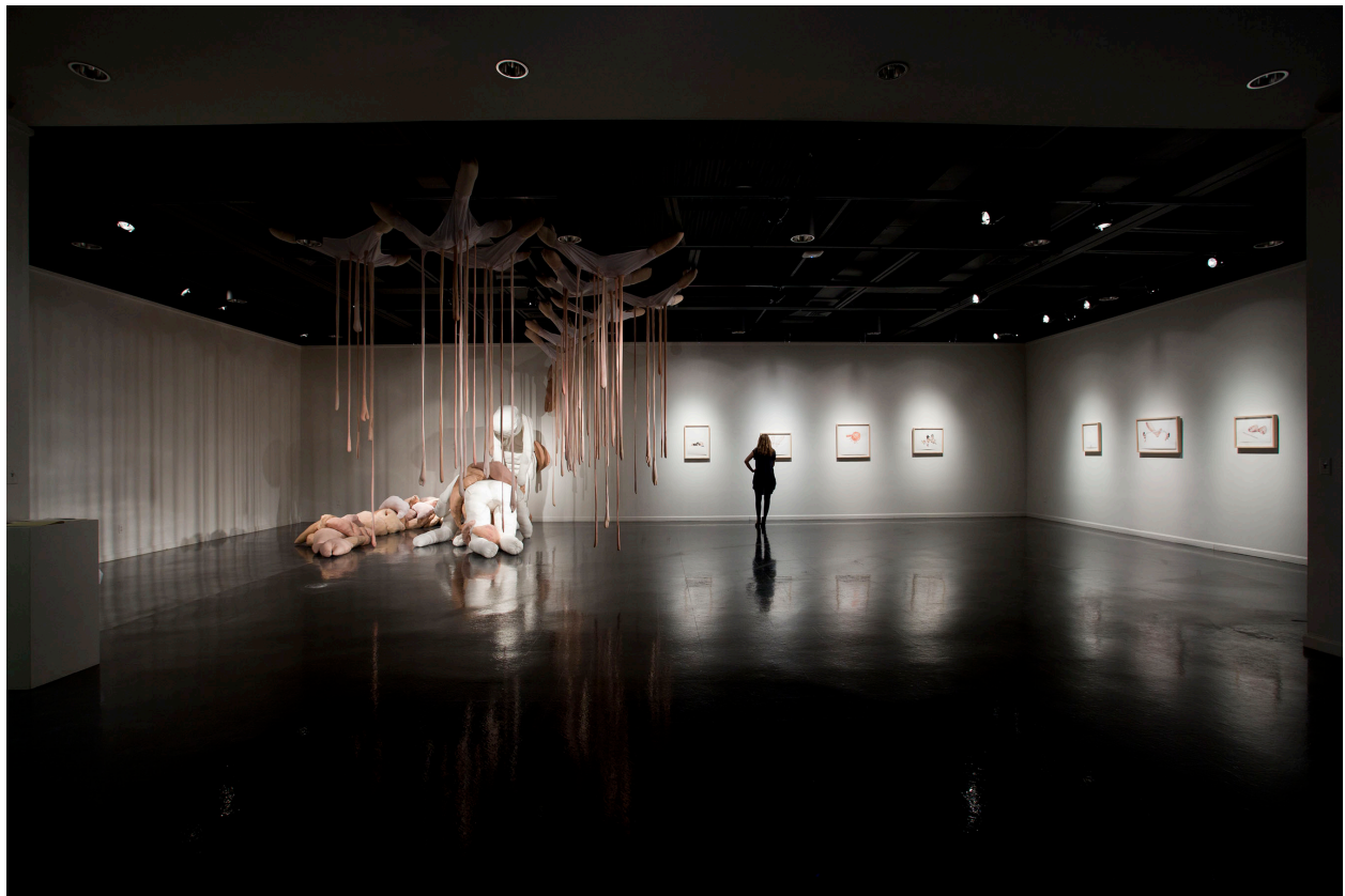
Figure 3 Anna Youngyeun. There, there . Full installation view. 2014.

objects that surround them. As viewers move through the space, they are faced with contrasting gallery experiences. Although initially, the two spaces may seem disconnected, they conceptually inform one another and draw from each other aesthetically in terms of composition and color.