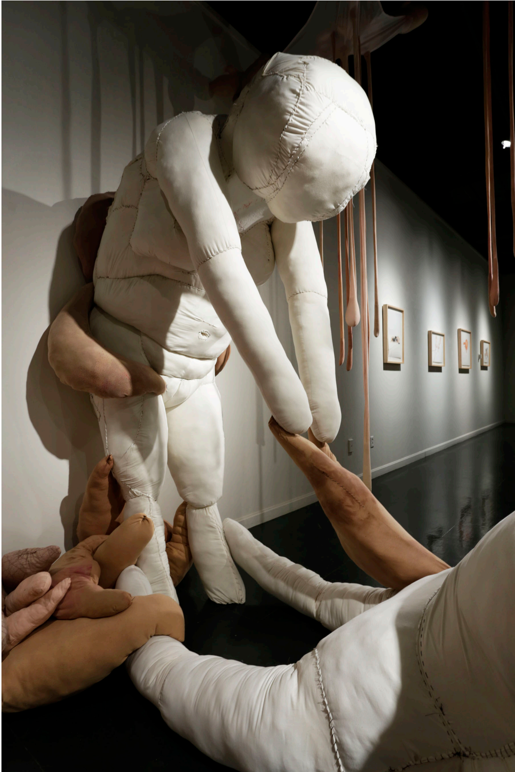
Figure 7 Anna Youngyeun. There, there. Installation view. 2014.