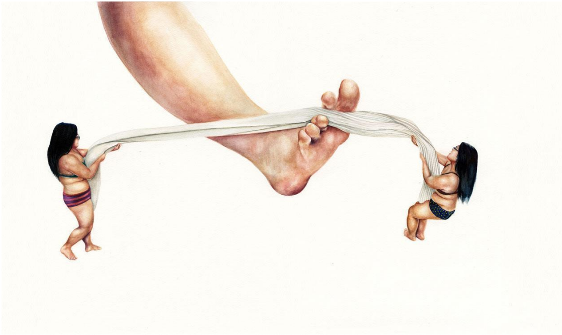
Figure 13 Anna Youngyeun. Protocol . Gouache on watercolor paper.

and invites viewers to engage both senses to some degree as essential parts of a search for comfort and belonging.