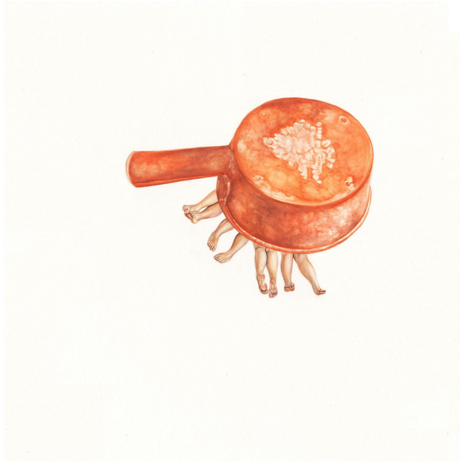
Figure 14 Anna Youngyeun. To Collect the Cream . Gouache on watercolor paper. 2014.

depression program. In my studio practice, humor is both a comfort and a form of confrontation. It serves not only as a gateway to acknowledging and embracing more melancholy realities and realizations, but also as an indulgence in lightheartedness.