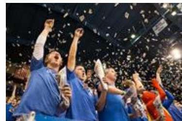
KU ON FLICKR