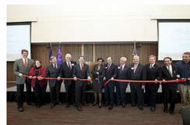
KU ON FLICKR

KU Edwards B.E.S.T. opening More: photos | videos