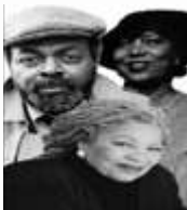
Exhibit: 100 Novels project

The Project on the History of Black Writing and the Center for Digital Scholarship at the University of Kansas will present a showing of selections from the 100 Novels project starting Thursday, March 15, at Watson Library.