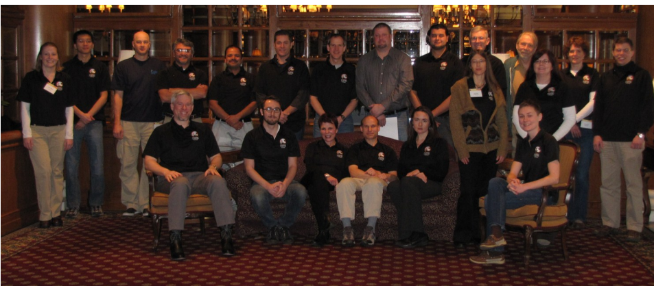
Researchers from The University of Kansas, Kansas State University, and Emporia State University are collaborating on the Biofuels and Climate Change: Farmers' Land Use Decisions (BACC:FLUD) project.

Understanding farmers' decisions is essential if we are to develop policies that respond to changes brought on by global warming and the growing need for renewable energy sources. The results from this project have the potential to facilitate more accurate policy scenarios and predictions of regional land use; they may also be used to better understand the potential impacts of climate change on the national agricultural sector and to give strong guidance to policy makers in this arena.