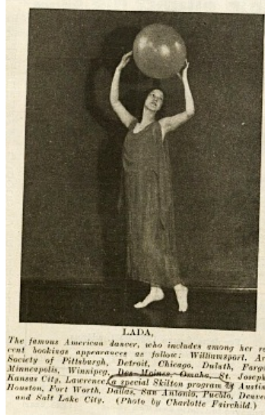
Figure 1 Lada in performance at Carnegie Hall

According to a New York Musical Courier article entitled “Three Skilton Compositions on Tour” dated 8 April 1920, Skilton’s Two Indian Dances were greatly enjoyed by audiences at Carnegie Hall: