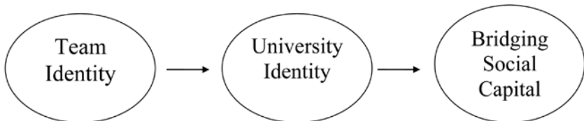
Figure 2 — Team Identity Impacting Bridging Social Capital