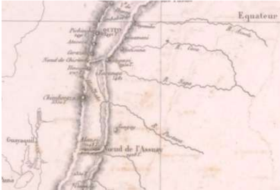
Figure 3. A segment of Humboldt own map of the area that includes the Chimborazo, to be available as an overlay on Google Earth. Source: Atlas géographiques et physiques des régions équinoxiales du Nouveau Continent, 1814-1838. Plate 25.