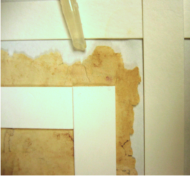
Fig. 2. Using a dropper to apply pulp.