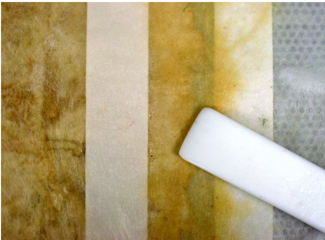
Fig. 3. Using a Teflon folder to encourage adhesion between pulp and paper.