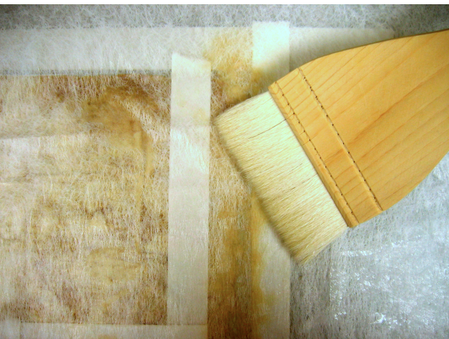
Fig. 4. Applying dilute methyl cellulose with a hake brush.

Minimal equipment was required to carry out this project, no more than a blender for mixing pulp and the suction table for the pulp filling process. A few basic supplies were required: pulp, thin blotter for use on the suction table, thicker blotter for masking the fill area, a water sprayer, a dropper and/or small beakers for pulp application, a Teflon folder or roller for smoothing the pulp after filling, spun polyester sheets, and a Japanese hake (sizing) brush.