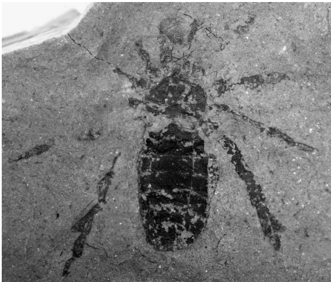
TEXT-FIG. 1. Arianrhoda bennetti gen. et sp. nov. Trigonotarbid arachnid from the early Devonian (Lochkovian) deposits at Tredomen, Wales; NMW 2003.15G.1a, part; \times 10 .