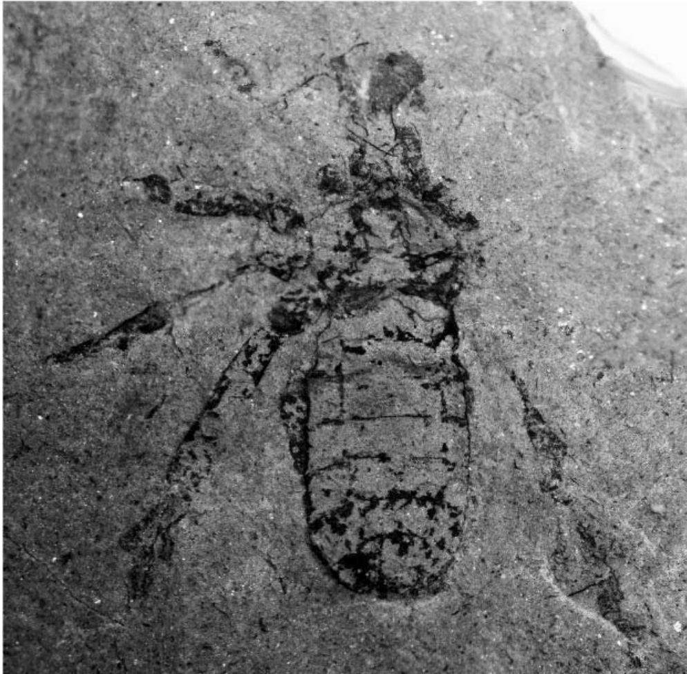
TEXT-FIG. 2. Counterpart (NMW 2003.15G.1b) of specimen in Text-figure 1; \times 10 .

(e.g. Hirst 1923; Shear et al. 1987; Shear 2000) or Trigonotarbitidae (e.g. Størmer 1970; Brauckmann 1987, 1994; Schultka 1991). There is also the unusual Alkenia mirabilis Størmer, 1970 from Alken an der Mosel. It was originally referred on stratigraphic grounds to Palaeocharinidae, was assigned with reservations to Aphantomartidae (Brauckmann 1994), but was not included in the aphantomartid revision of Rössler (1998). The Palaeocharinidae were originally diagnosed on the retention of multifaceted lateral eyes, but this is clearly a plesiomorphic character for arachnids and Shear (2000) rediagnosed palaeocharinids on the putative autapomorphy of fusion of the divided ninth tergite into a single sclerite. Both this fused tergite 9 character, and the lateral eye tubercles, are absent from the new fossil and exclude it from Palaeocharinidae. It should be added that Shear's late Devonian palaeocharinid closely resembles the Carboniferous aphantomartids (see especially figures in Rössler 1998) in the lobation of the carapace and tuberculation of the opisthosoma; thus Palaeocharinidae may not be monophyletic as it currently stands.