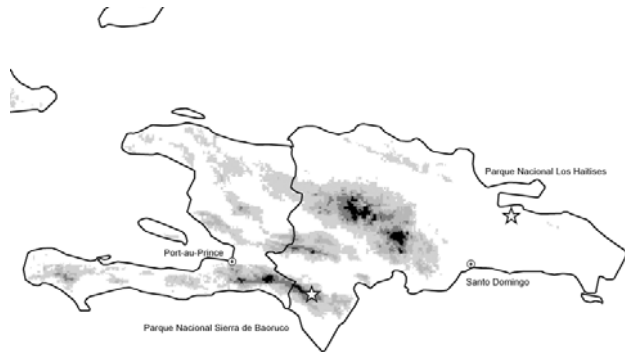
Figure. Hispaniola in the West Indies, on which are located Haiti (western third of the island) and the Dominican Republic. West Nile virus transmission occurred at Parque Nacional Los Haitises before November 2002. Shades of gray are 500-m intervals (e.g., 0–500, 500–1000).

Serum samples were screened for flavivirus-neutralizing antibodies by plaque-reduction neutralization test (PRNT) according to standard methods (11) and by using challenge inocula of 100 plaque-forming units (PFU) WNV strain NY99-4132 and Saint Louis encephalitis virus (SLEV) strain TBH-28. Testing for neutralizing antibody