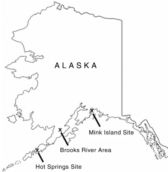
Figure 1. Geographic location of Alaska Peninsula archaeological sites.

of the peninsula come from excavations directed by Don Dumond of the University of Oregon in the Naknek/Brooks River area (Dumond 1987b; Harritt 1988; Hilton 1998). A number of samples derive from excavations at the Paugvik site on the Naknek River, a part of the Brooks River drainage (Dumond 1981), and the remainder of this group comes from excavations of a cluster of sites along the Brooks River itself (Dumond 1987b; Harritt 1988).