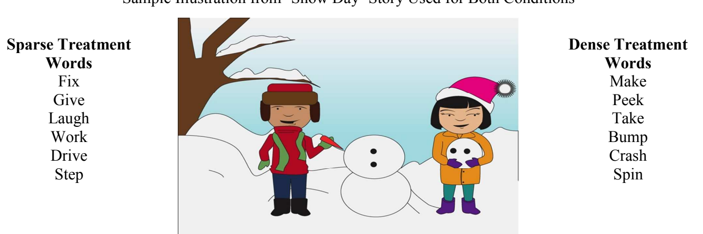
Appendix I Sample Illustration from 'Snow Day' Story Used for Both Conditions