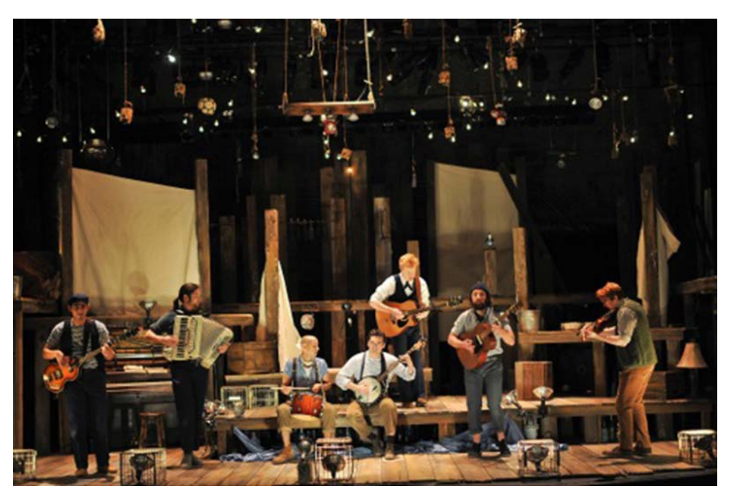
Fig. 3. PigPen Theatre Co.'s production of The Old Man and the Old Moon at The New Victory Theater, New York City (2014).

actors remain in character and field questions from their peers in a Boalian forum. Assessments of this program find that student actors successfully alter their peers' bystander attitudes and rape myths (McMahon et al.). Troupes such as these serve to validate the social purposes of theatre while extending the visibility of theatre departments.