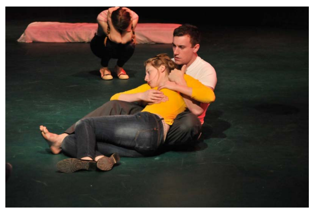
Fig. 2. "Playground 2012."